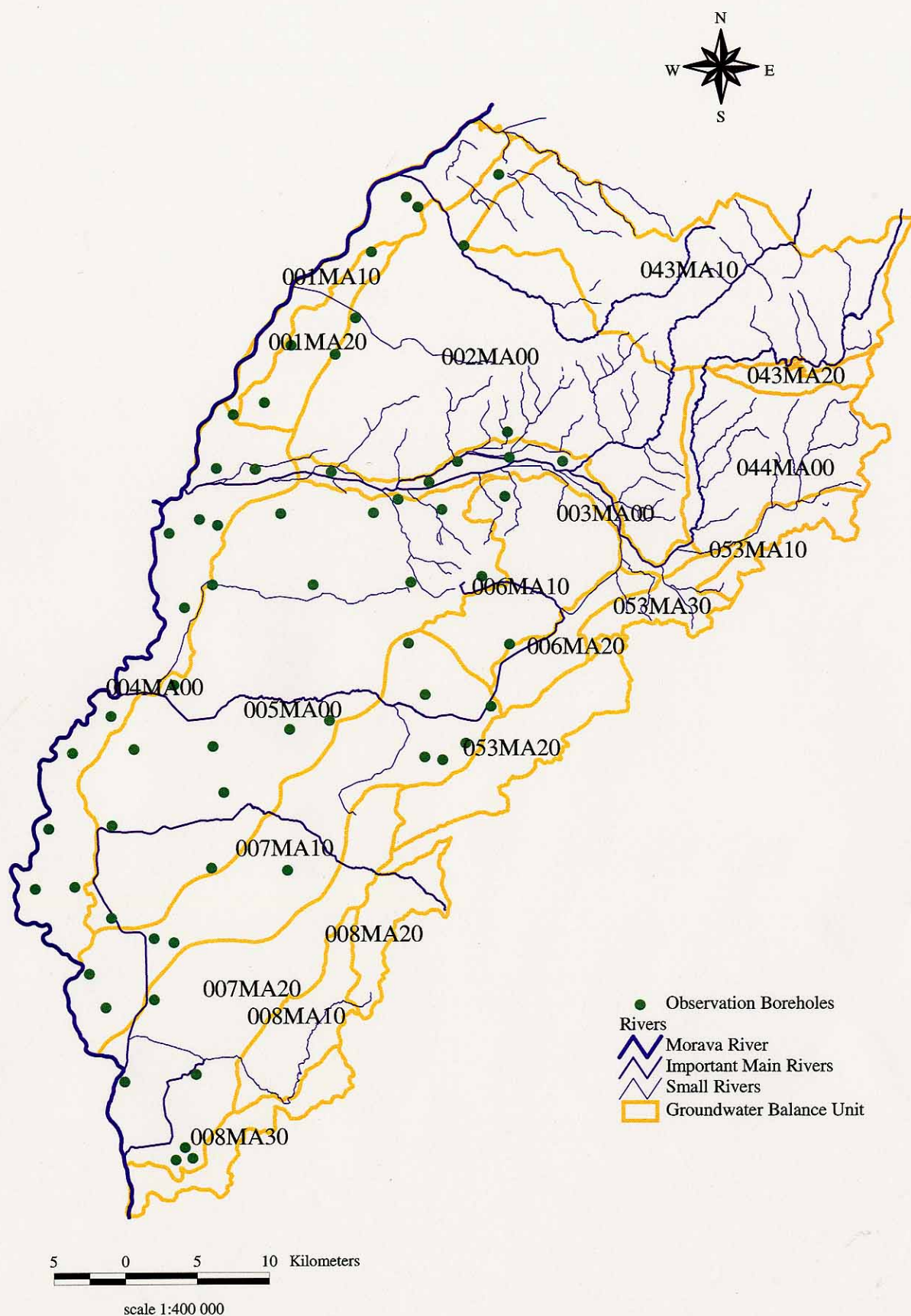
Figure C.4.2 Groundwater Balance Units and Groundwater Observation Network of Morava River Basin