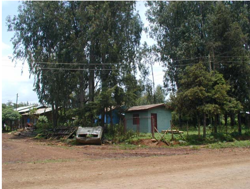
Attachment 5.2.1.2 - No.10