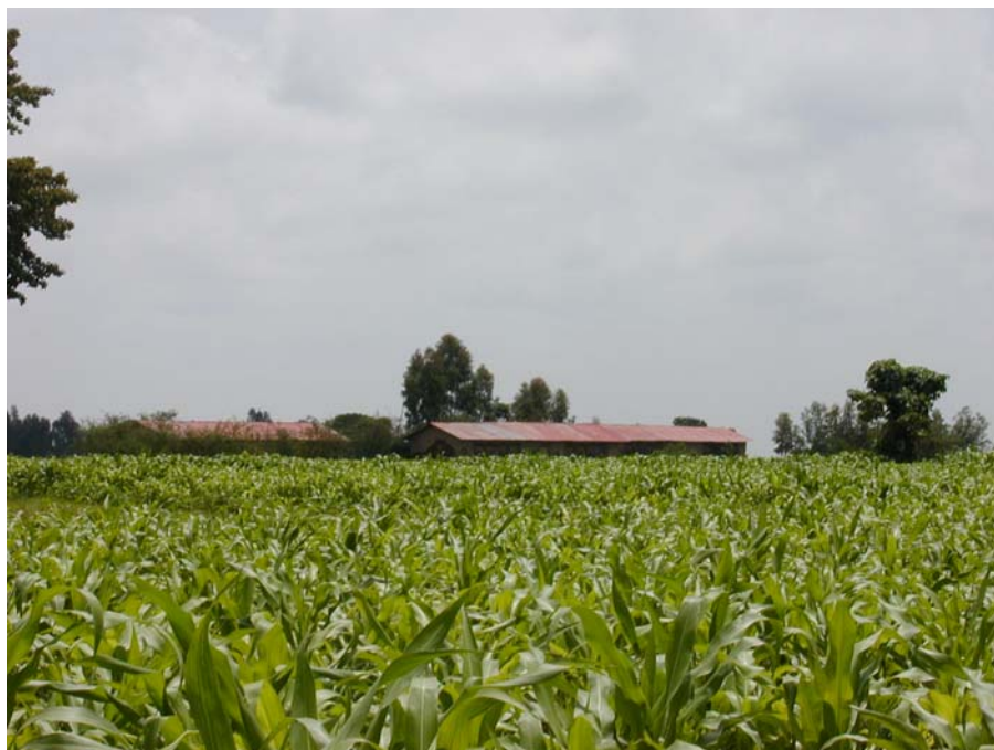
Attachment 5.2.1.2 - No.8