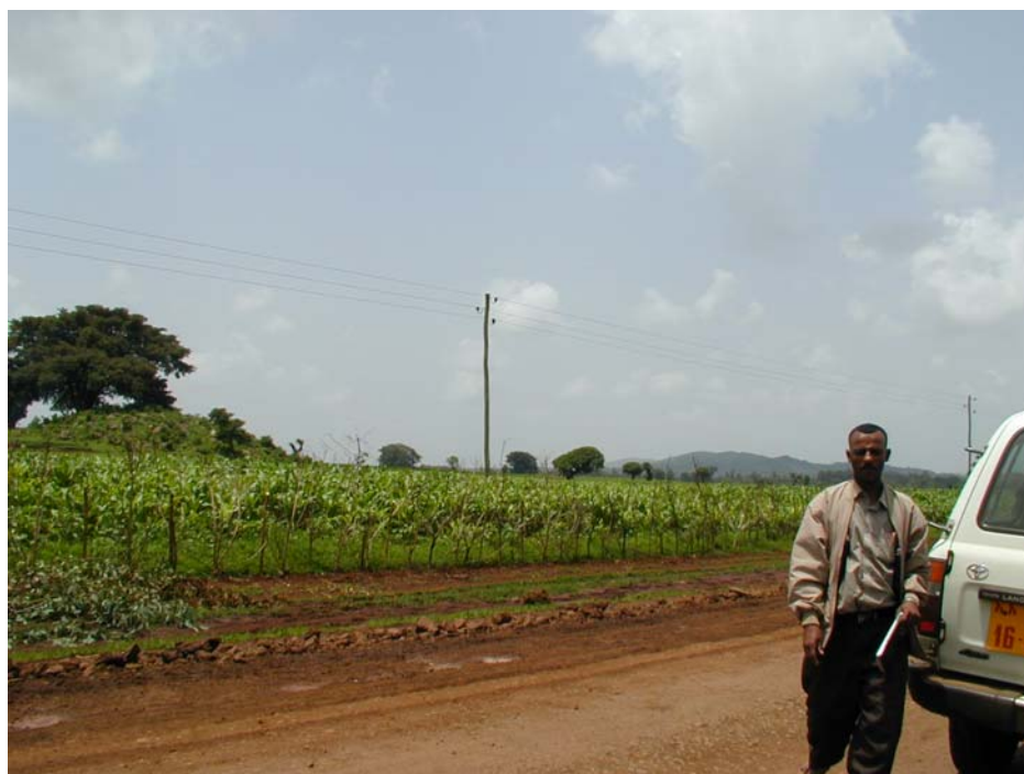
Attachment 5.2.1.2 - No.9