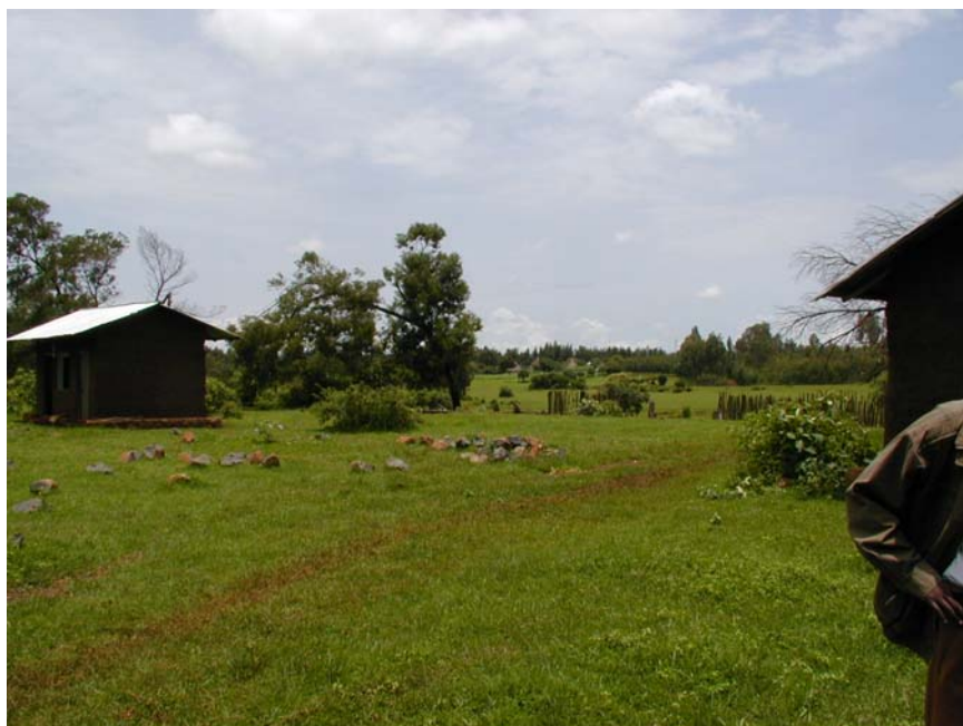
Attachment 5.2.1.2 - No.6