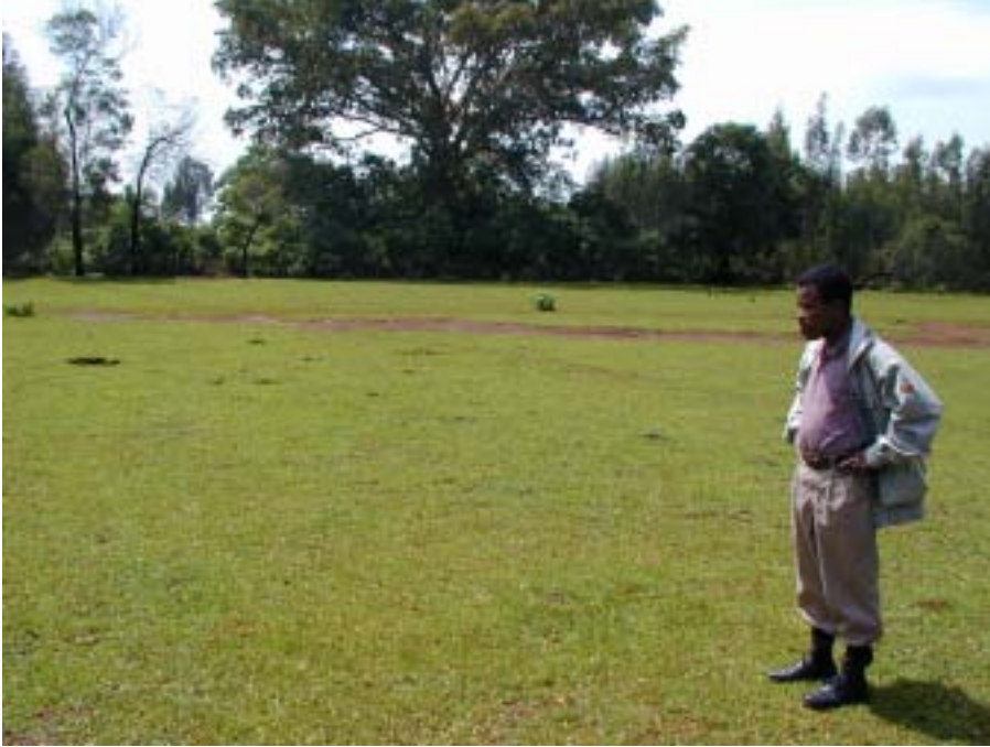
Attachment 5.2.1.2 - No.7