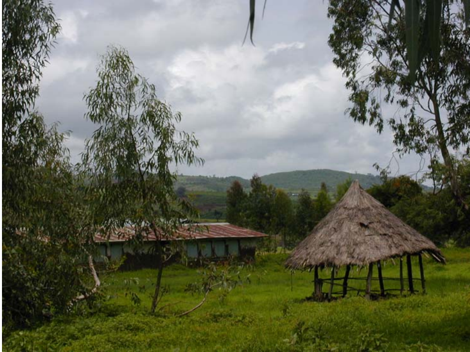
Attachment 5.2.1.1 - No.3