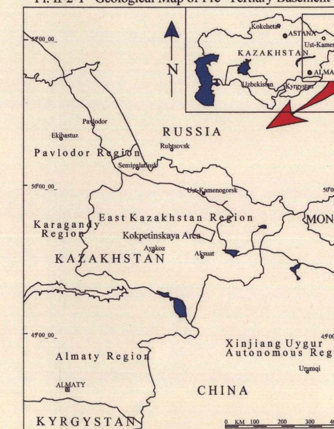
Pl. II-2-1 Geological Map of Pre-Tertiary Basement

JAPAN INTERNATIONAL COOPERATION AGENCY METAL MINING AGENCY OF JAPAN JANUARY 2003