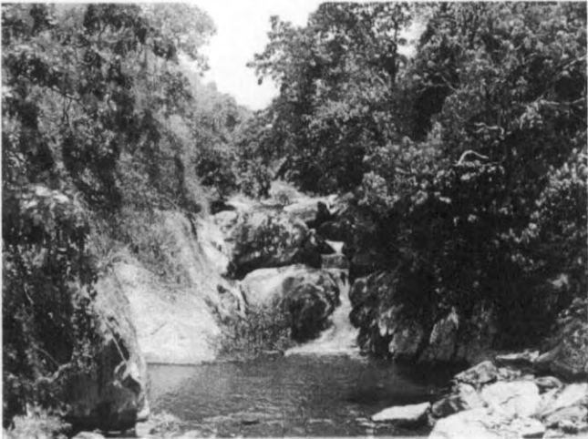
Lizunghuni River at mouth of a river to Malawi Lake