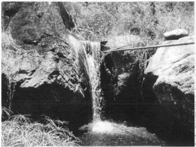
Drinking water facilities installed in Murwerzi River