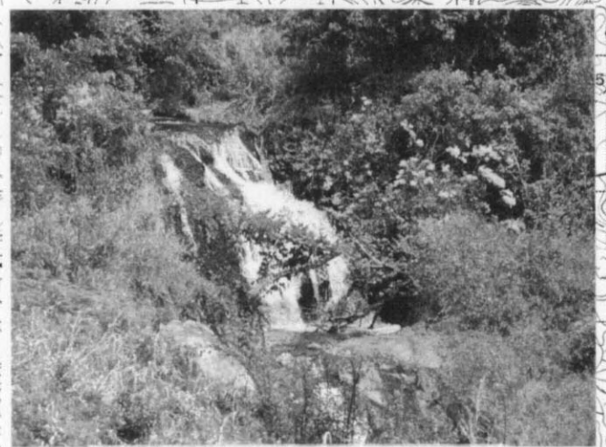
Waterfall in the Nchenachena River