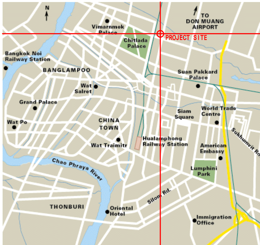
CITY OF BANGKOK