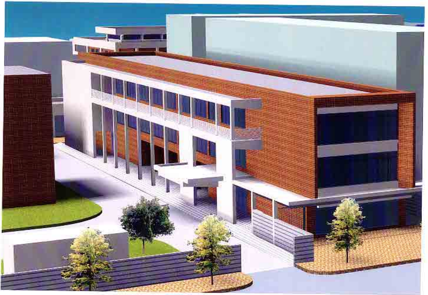
PERSPECTIVE: ADMINISTRATION BUILDING