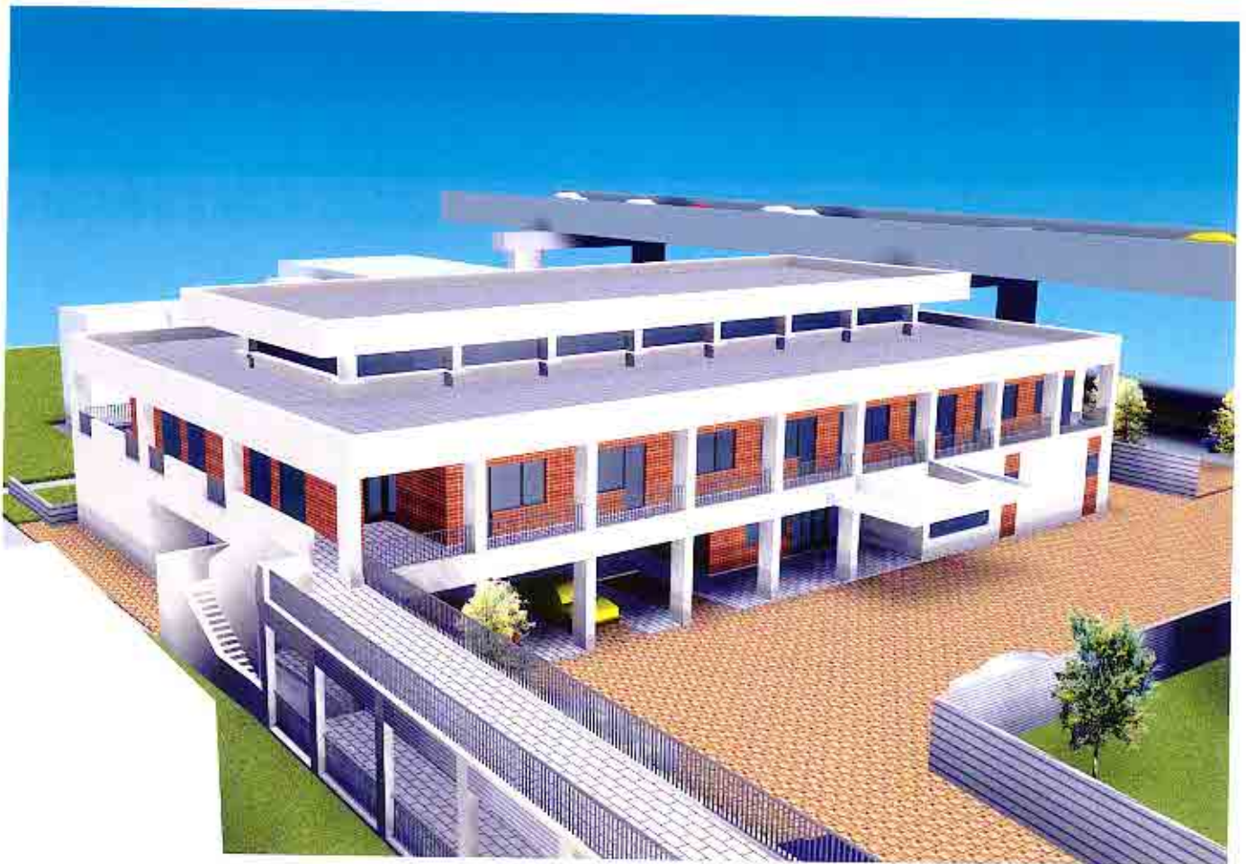
PERSPECTIVE: TRAINING BUILDING