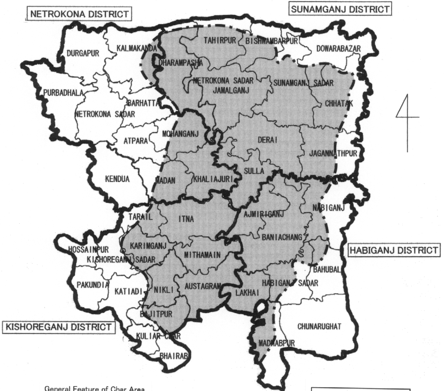
General Feature of Char Area