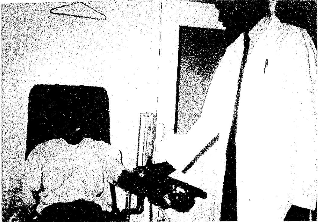
A donor being bled: More of them are required