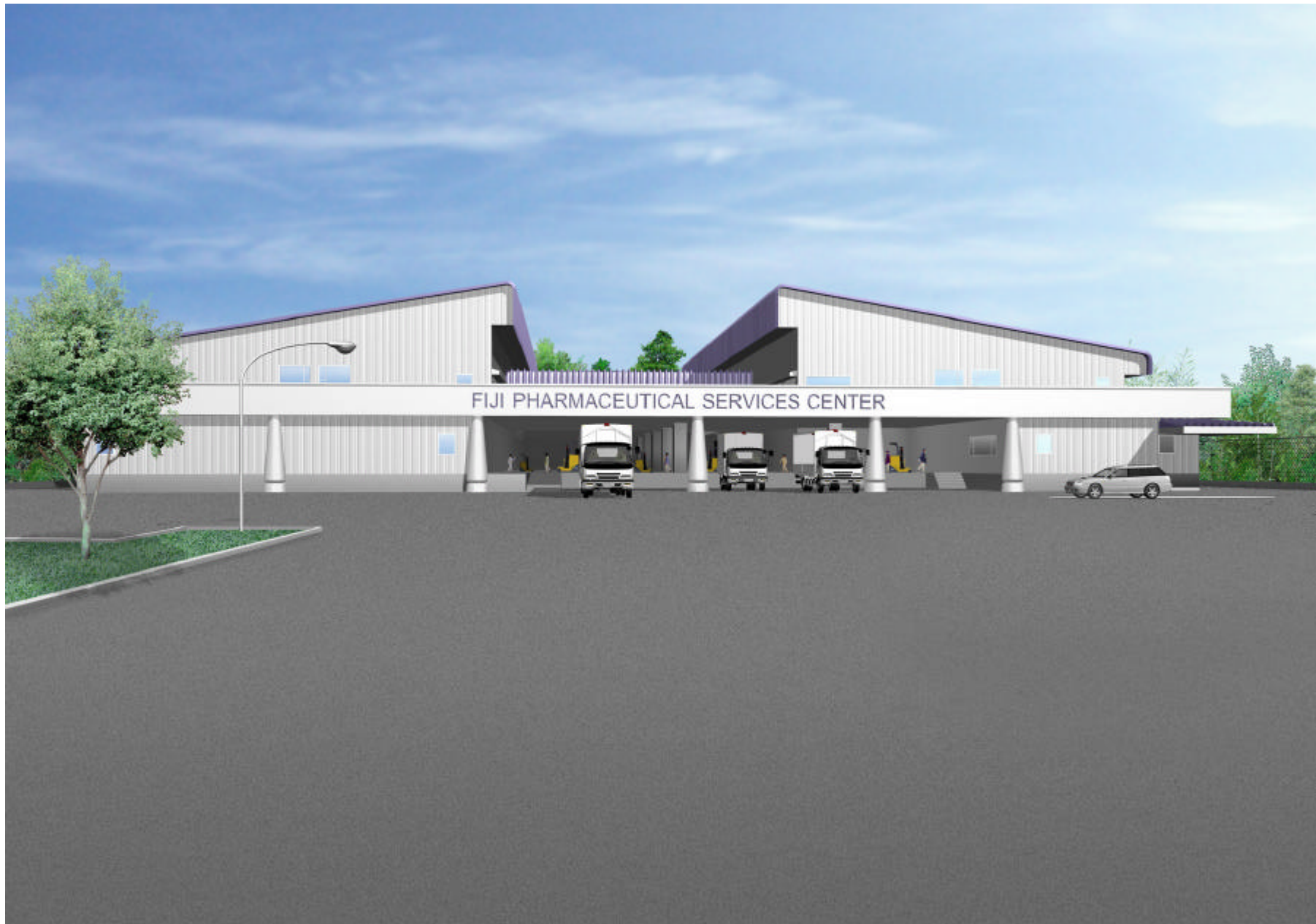
THE PROJECT FOR CONSTRUCTION OF THE NEW FIJI PHARMACEUTICAL SERVICES CENTER