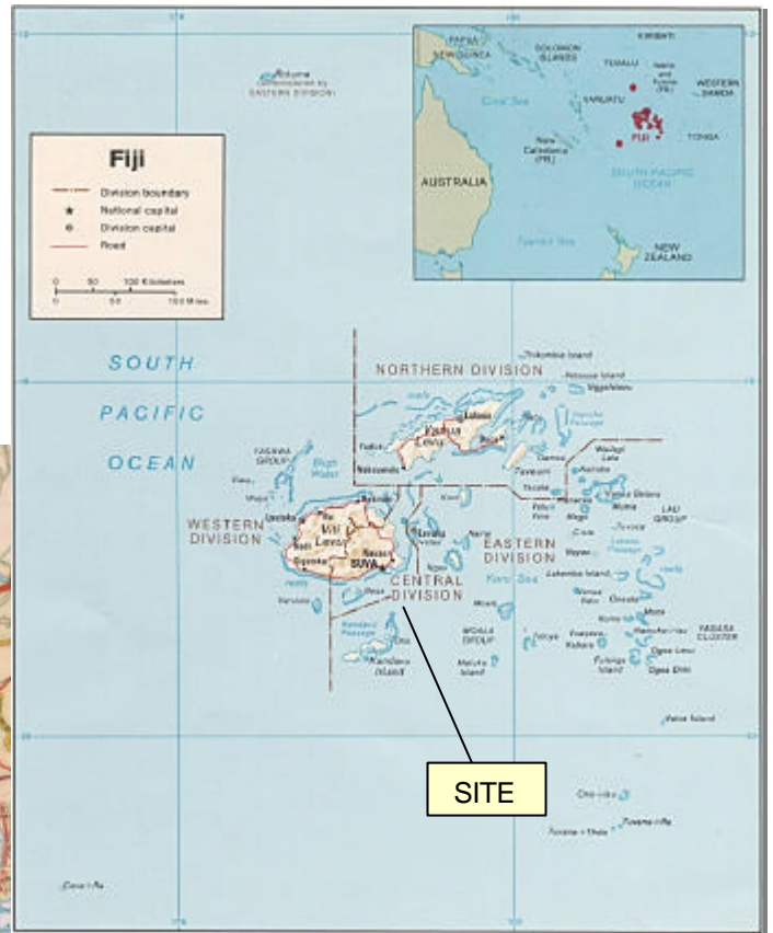
Map of FIJI