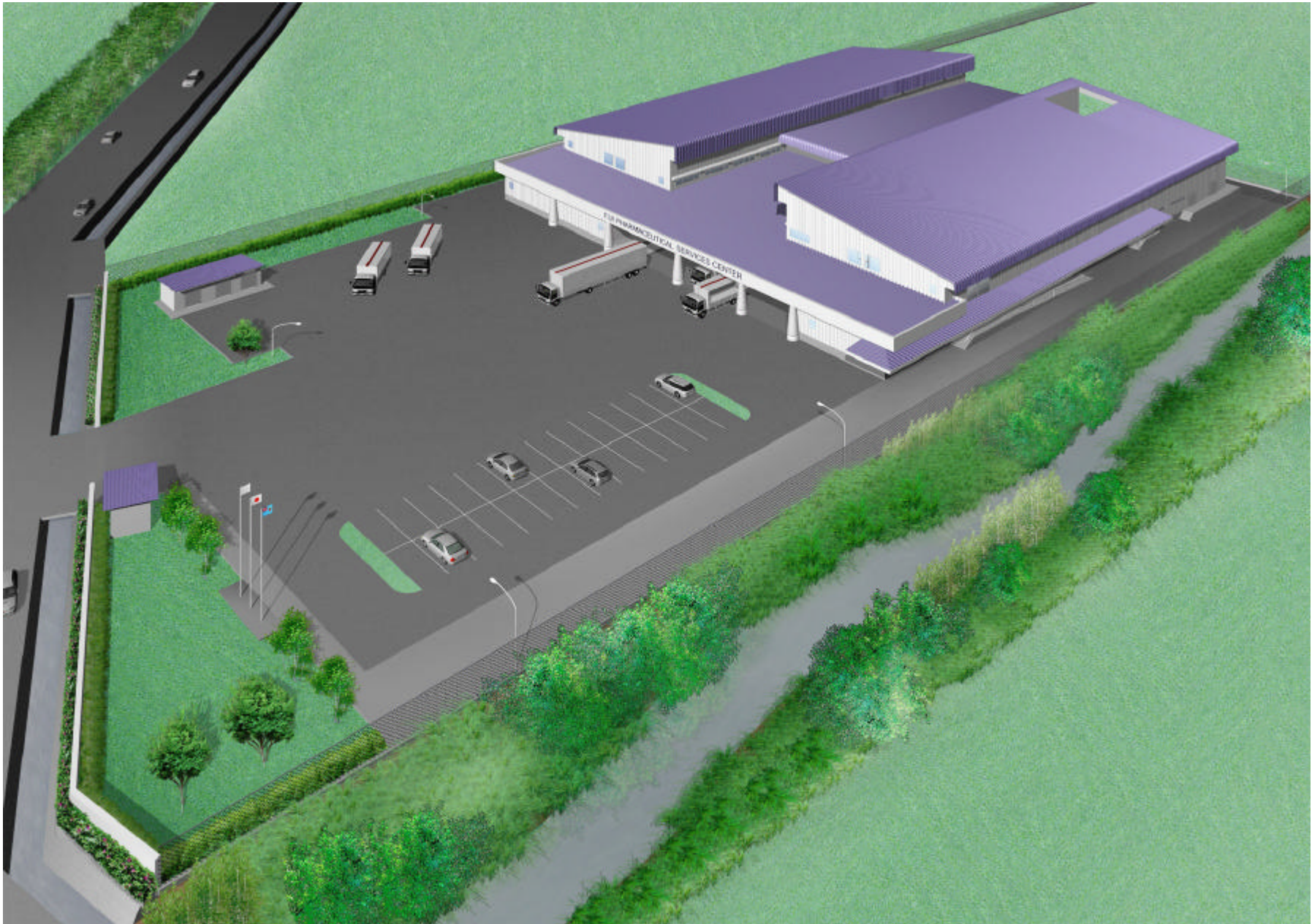
THE PROJECT FOR CONSTRUCTION OF THE NEW FIJI PHARMACEUTICAL SERVICES CENTER