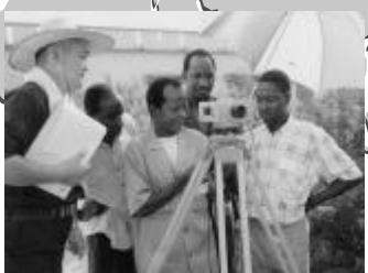
Field work operation

Technology transfer was conducted successfully.