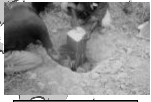
Ground control point