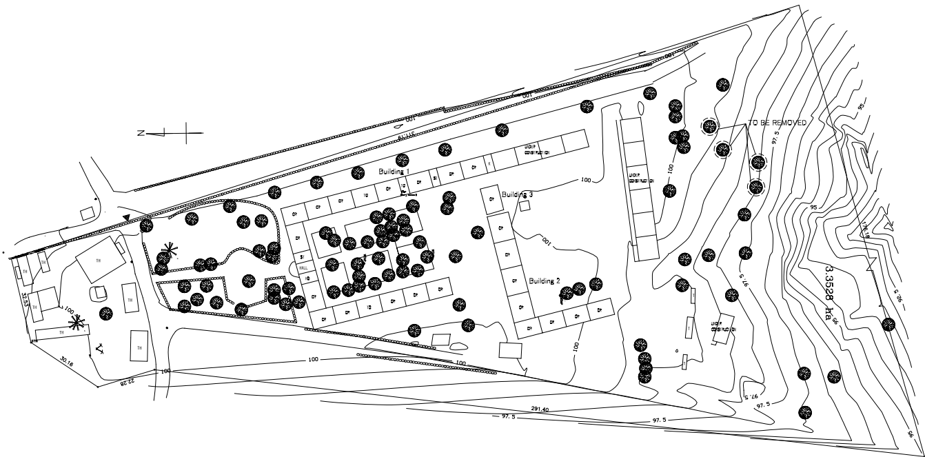
EXISTING SITE CONDITION