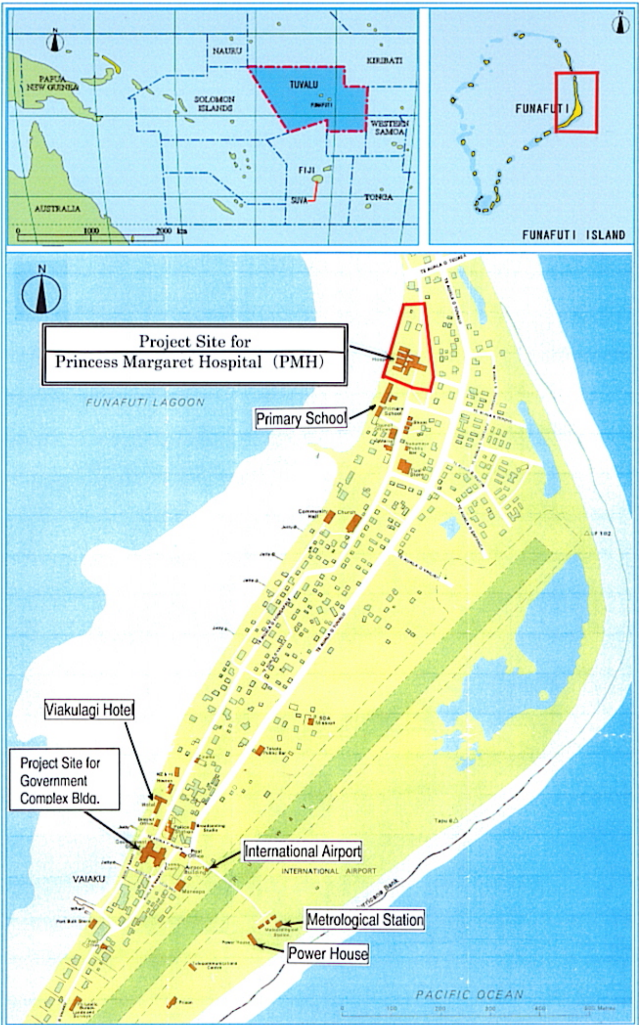
LOCATION MAP OF THE PROJECT SITE-2