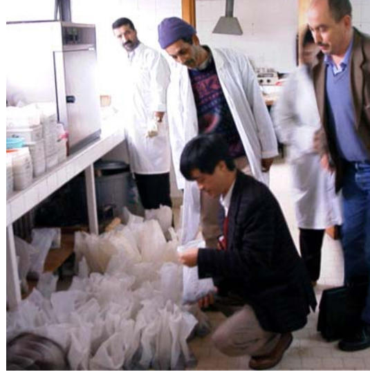
Photo No.60 Soil Sample for Analysis