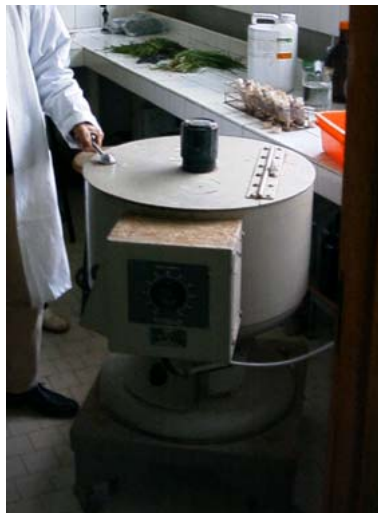
Photo No.66 Centrifuge