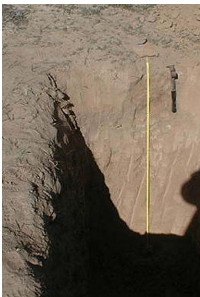
Photo No.27 Point②, Class II Sols Peu Evolues