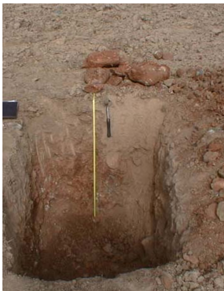
Photo No.26 Point①, Class III Sol a Sequioxydes de Fer