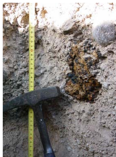
Photo No.17 Concretion in impermeable layer