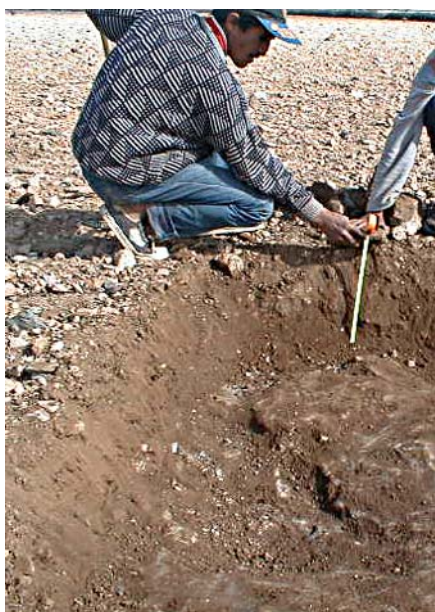
Photo No.28 Point③, Class IV Calcimagnesiques Shallow Soil Depth