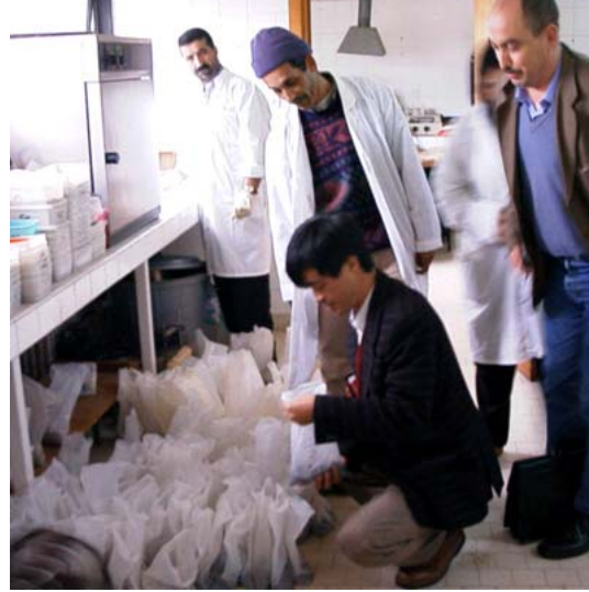
Photo No.60 Soil Sample for Analysis