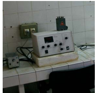
Photo No.67 Flame Photometer