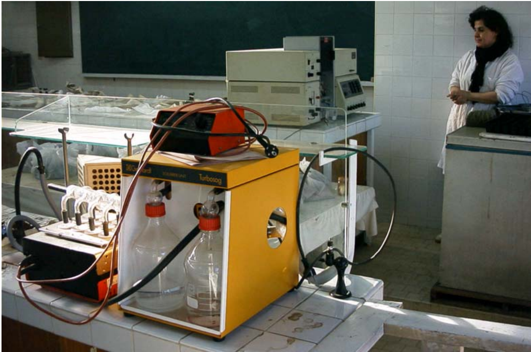
Photo No.64 Equipments of Atomic Absorption (behind) and Kjeldahl Analysis (front)