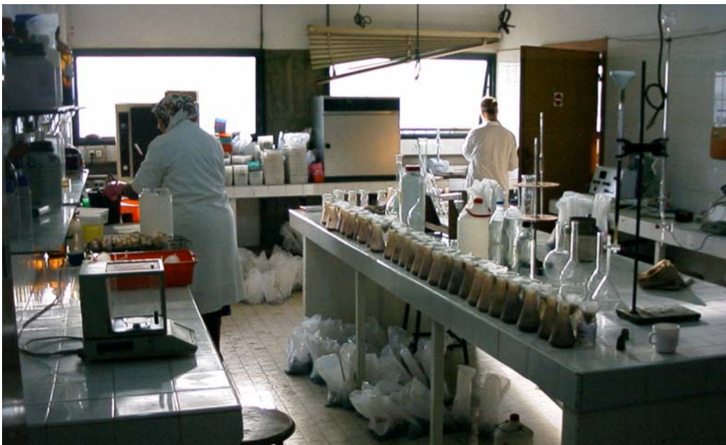
Photo No.63 Extraction of Soil Solution