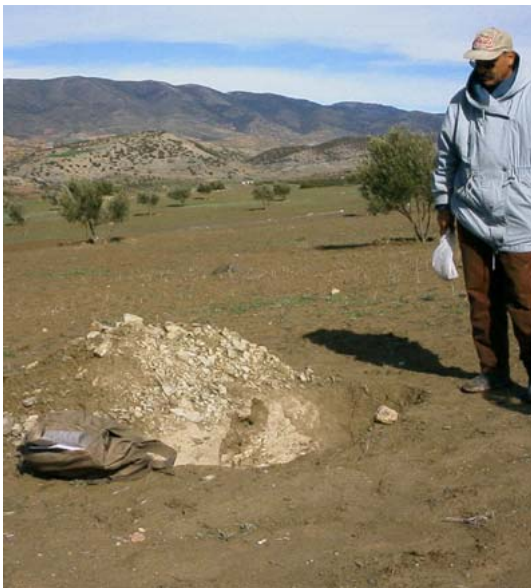
Photo No.51 Point ① Left Bank, Sloping area Shallow soil depth (30-40cm)