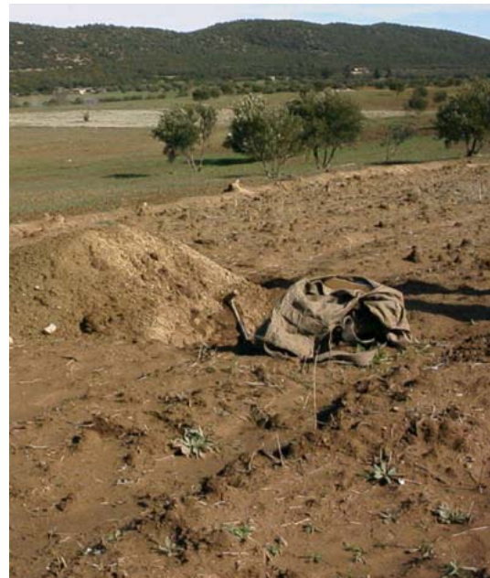
Photo No.52 Point ② Left Bank, Gentle sloping area Soil depth (more than 1m)