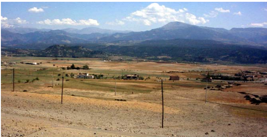
Photo No.49 Overview of Azghar Area