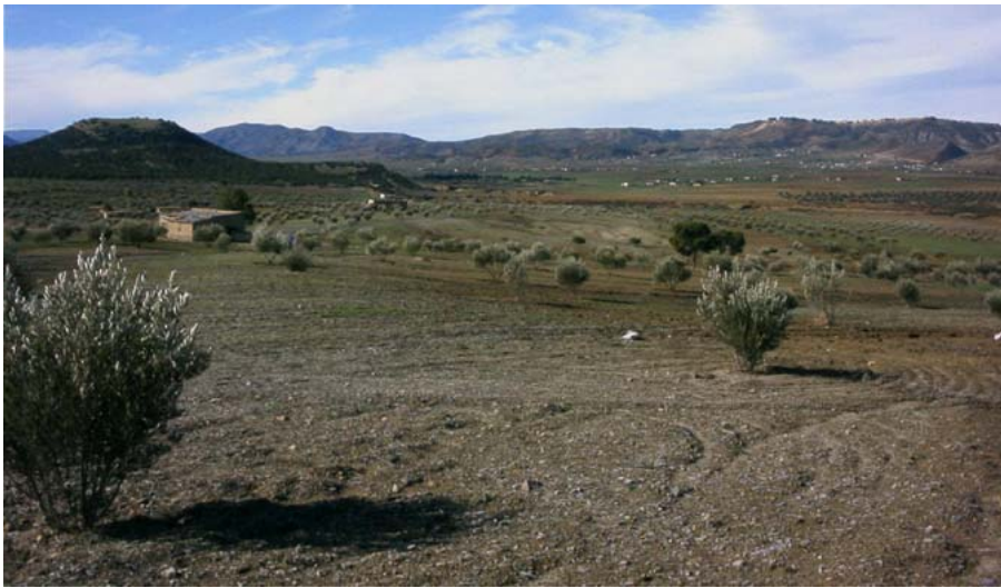
Photo No.48 View at Upstream of Left Bank of the River (Wad Zloul), near dam site