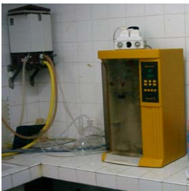
Photo No.65 Nitrogen Analysis