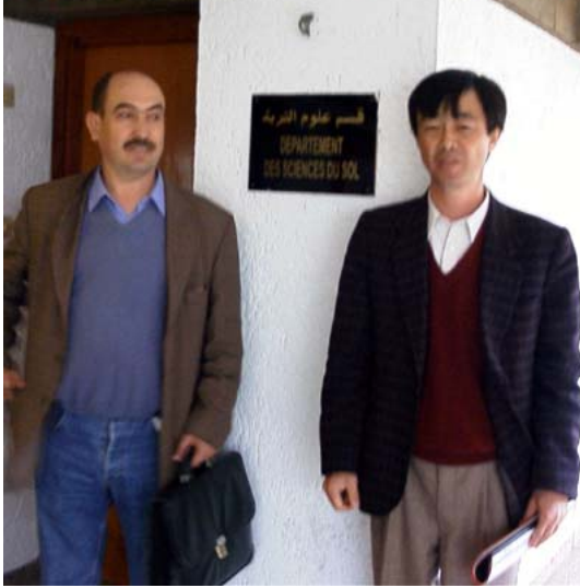
Photo No.59 At the Entrance of Laboratory