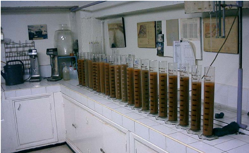
Photo No.62 Mechanical Analysis