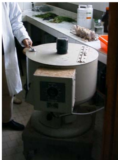
Photo No.66 Centrifuge