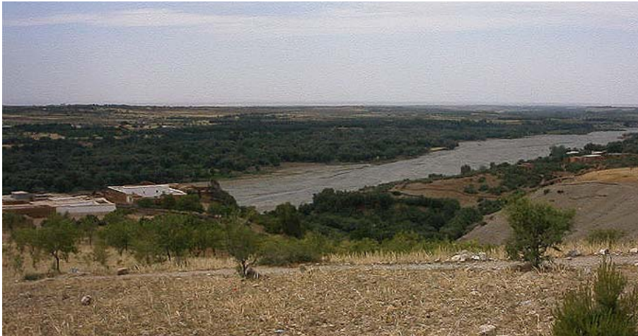
Photo No.23 Agricultural Land on Left Bank of Asif El Mar River View from allow (1) on the Map