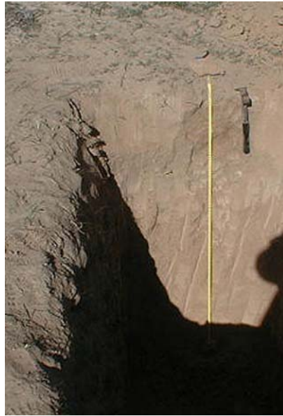
Photo No.27 Point②, Class II Sols Peu Evolues