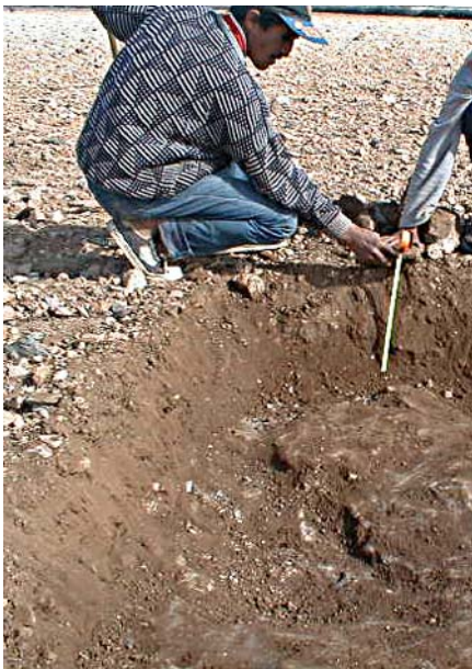
Photo No.28 Point③, Class IV Calcimagnesiques Shallow Soil Depth