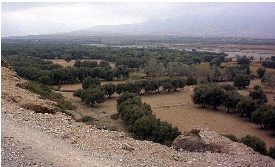
Photo No.24 Cereal and Olive land on Alluvial Plain of Asif El Mar River View from allow (2) on the Map