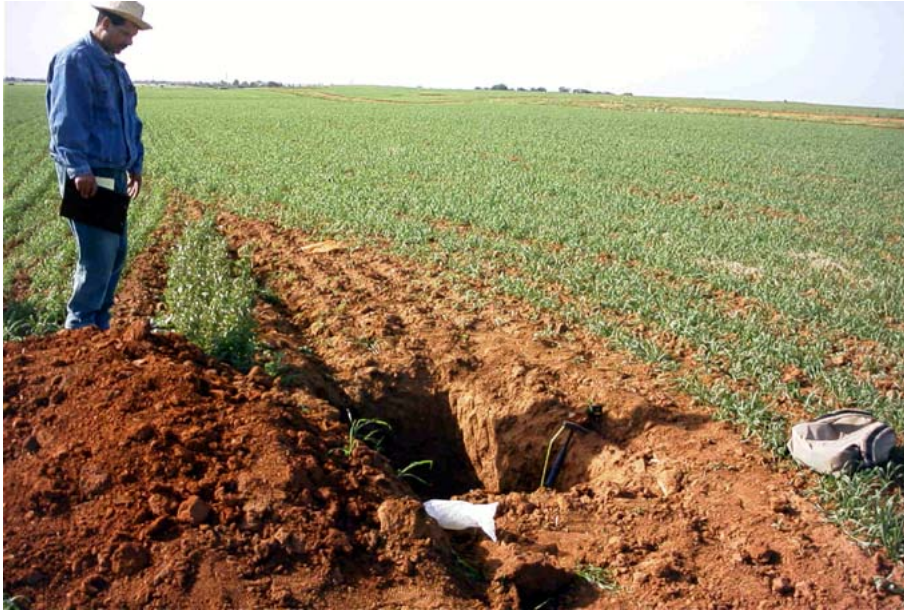
Photo No.18 Point ② Soil Profile and View (Northeast of Potential Area)