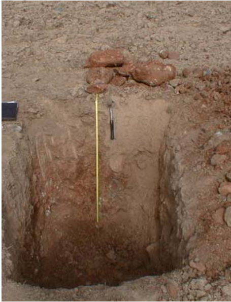
Photo No.26 Point①, Class III Sol a Sequioxydes de Fer