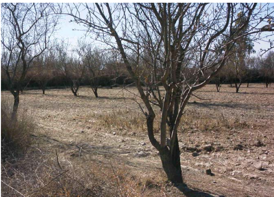
Photo No.25 Almond trees and cereal cultivation (Mixture cultivation)