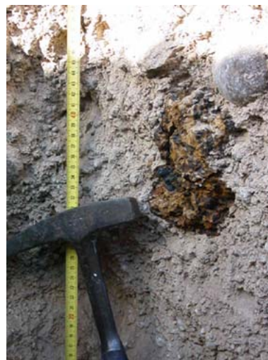
Photo No.17 Concretion in impermeable layer