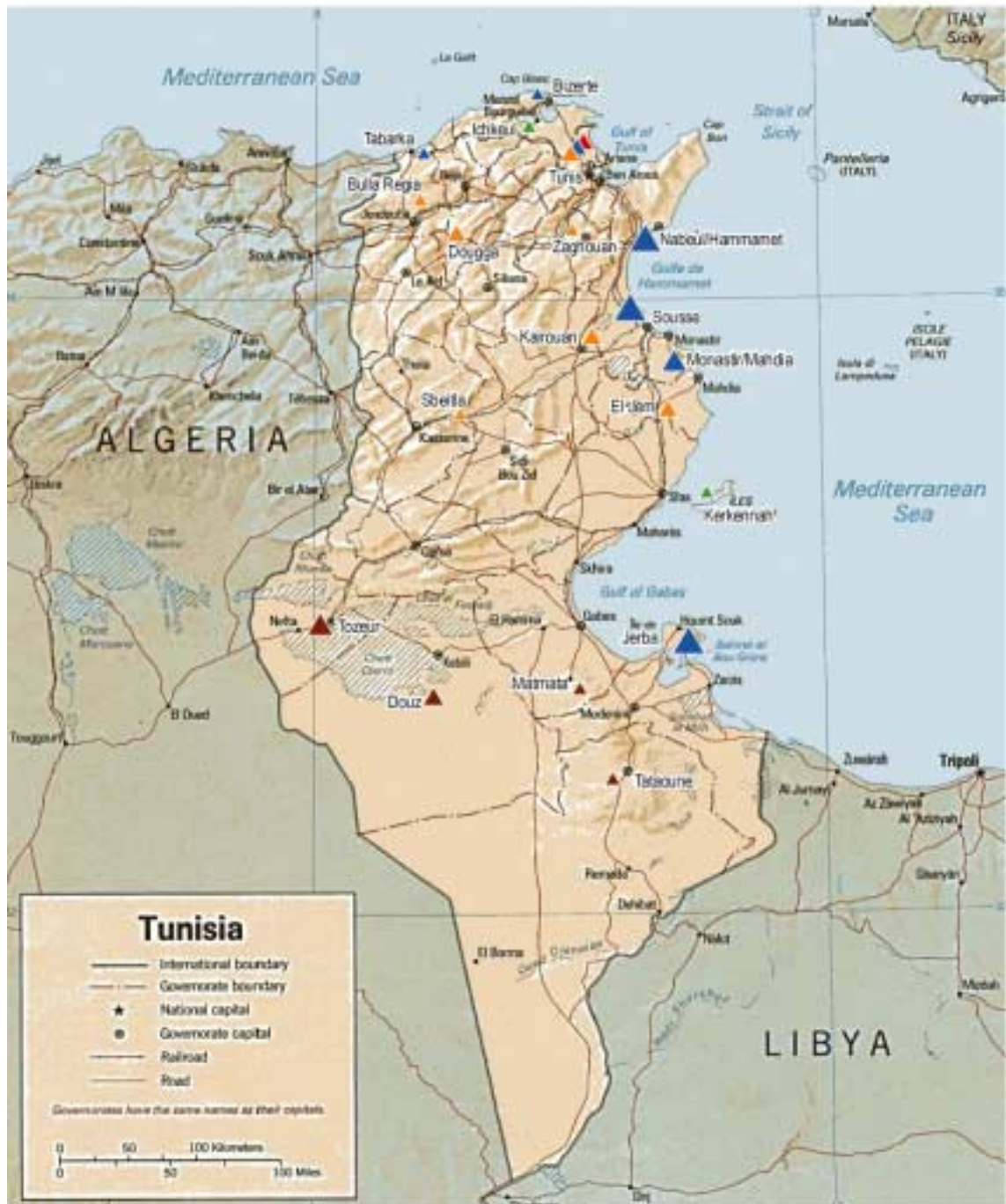
Tourism core and resources