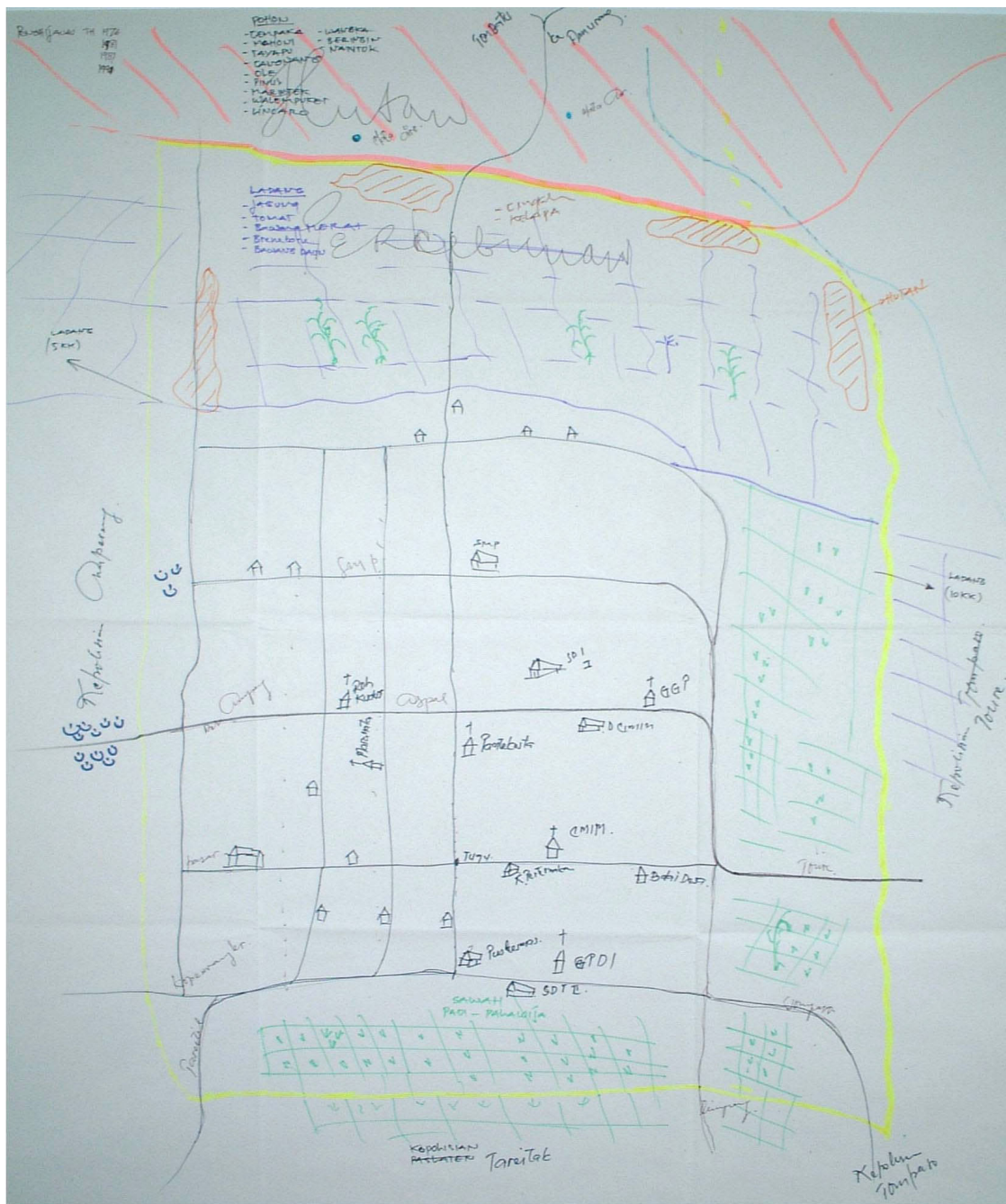
The Study on Critical Land and Protection Forest Rehabilitation at Tondano Watershed in the Republic of Indonesia