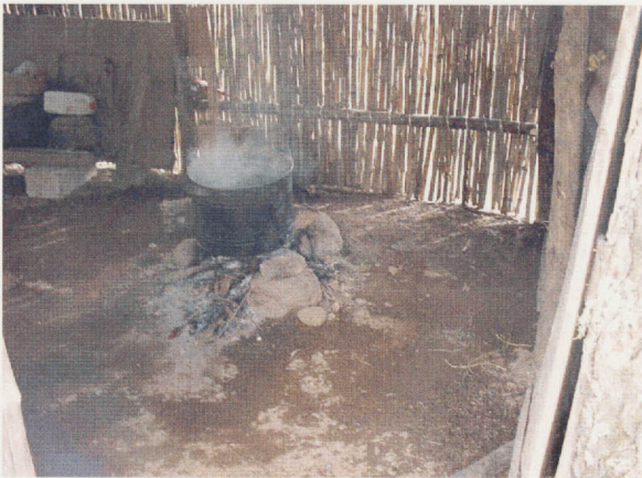
Situation of cooking with traditional stove