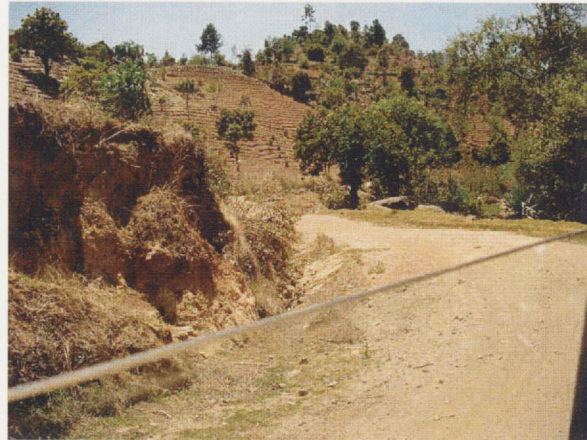
Road condition in the community