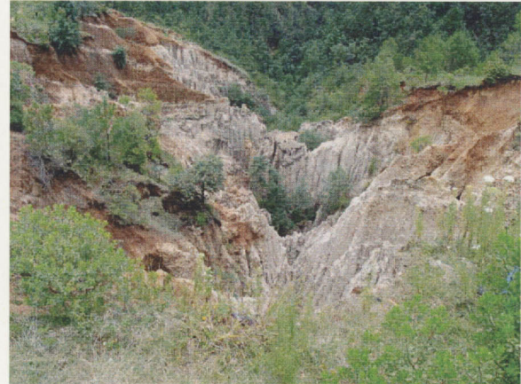
Soil erosion at the left bank of the watershed