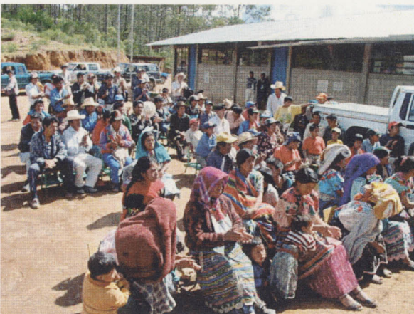
General public meeting conducted under the participatory survey