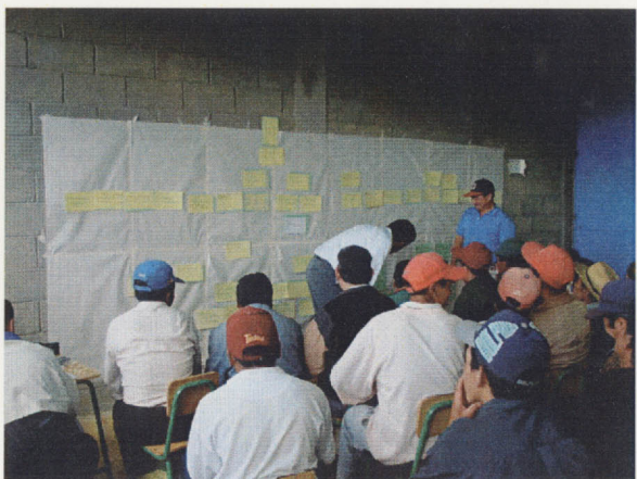
Problem analysis with PCM method during community representative meeting