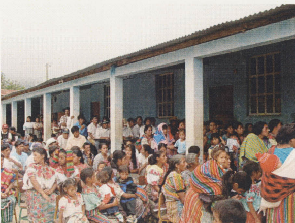
General public meeting conducted under the participatory survey