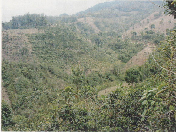
Condition of coffee-planted steep area