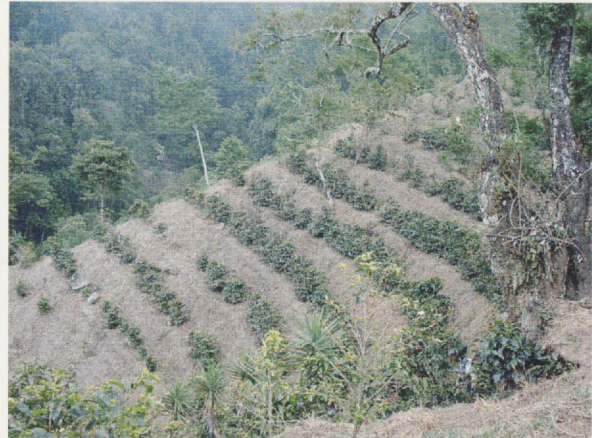
Condition of coffee cultivation