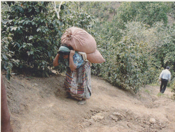
Condition of coffee beans transportation during harvest season