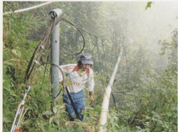
Water supply pipe nearby the water source (easy to be broken by falling stone, etc. because of insufficient installation)