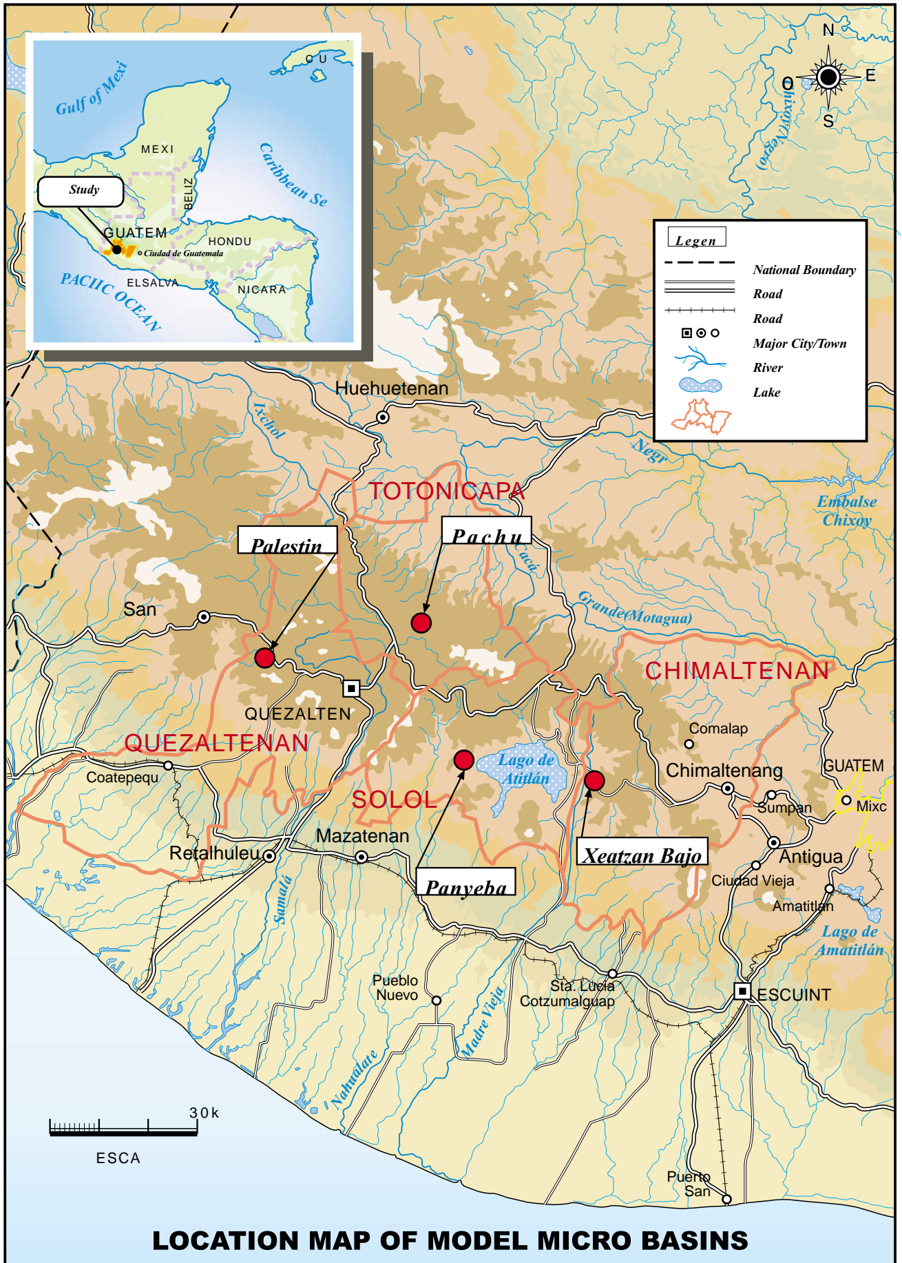
LOCATION MAP OF MODEL MICRO BASINS