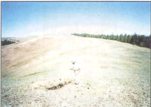
Plate 72 Tsagaan uul district, Gurvan buudal uul (No.96)