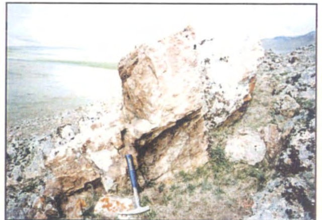
Plate 89 Tosontsengel district, Davaa (No.103)

Outcrop of granite with quartz network vein.