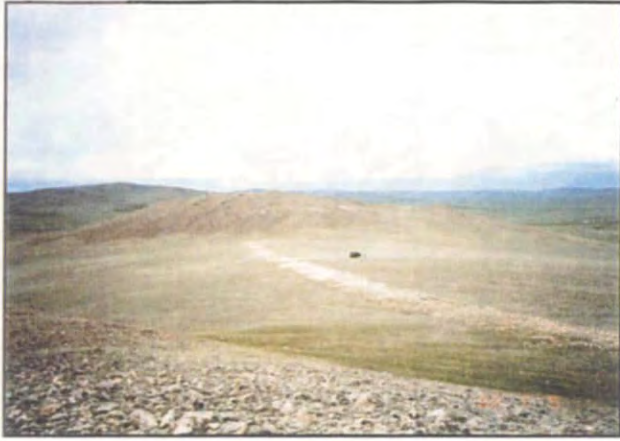
Plate 68 Tsagaan uul district, Deed ulaan tolgoi (No.94)