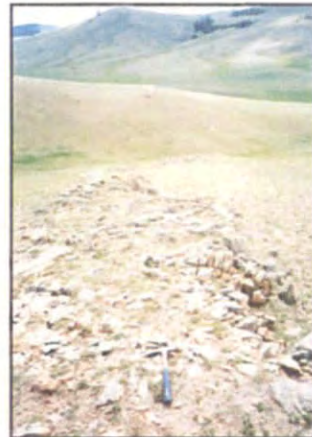
Plate 61 Murun West district, Ulaannuur (No.90)

Panoramic view of the investigated area.