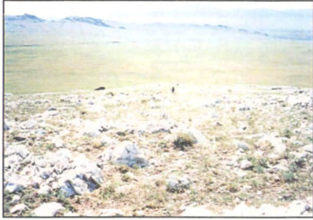
Plate 57 Murun West district, Tsagaan tolgoi (No.89)