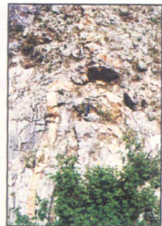
Plate 67 Tsagaan uul district, Nariin azarga (No.93)