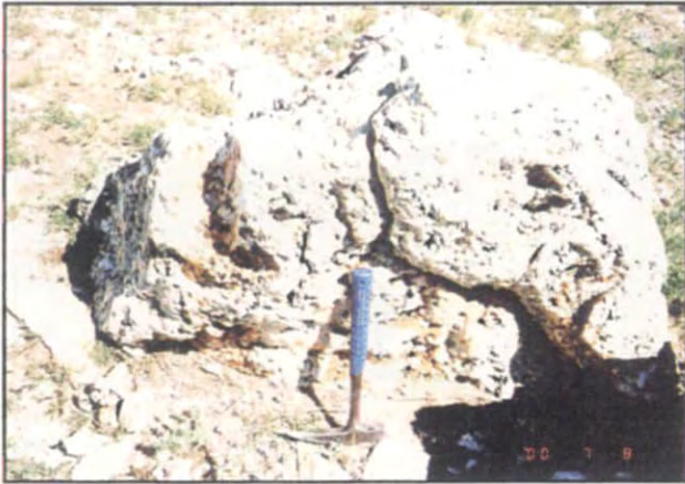
Plate 58 Murun West district, Tsagaan tolgoi (No.89)