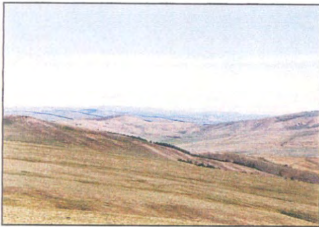
Plate 64 Tsagaan uul district, Tsagaan uul (No.92)

Outcrop of pelitic shist with quartz vein.