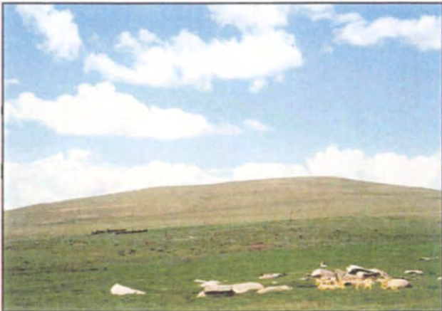
Plate 60 Murun West district, Ulaannuur (No.90)

Potassic altered granite (drilling core).