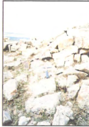
Plate 69 Tsagaan uul district, Deed ulaan tolgoi (No.94)