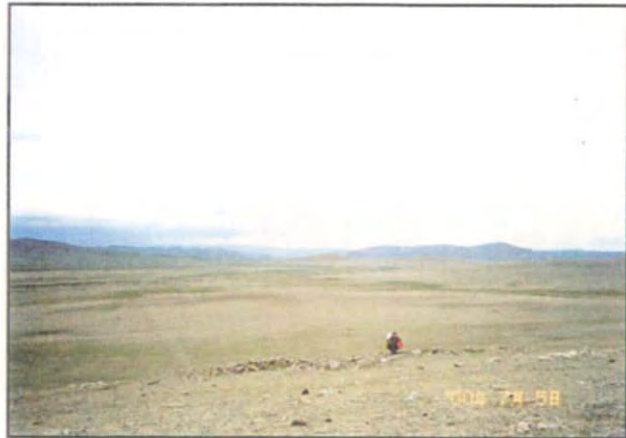
Plate 71 Tsagaan uul district, Ulaan zavsar (No.95)

Panoramic view of the investigated site.