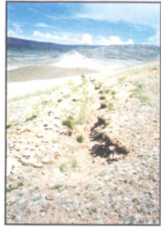
Plate 87 Tosontsengel district, Quartzite (No.102)