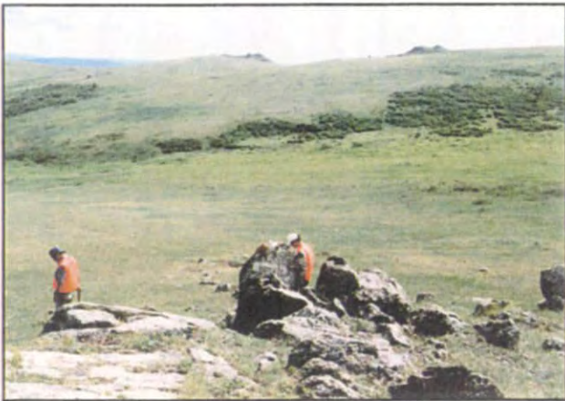
Plate 84 Tosontsengel district, Occurrence124-B-4,5 (No.101)