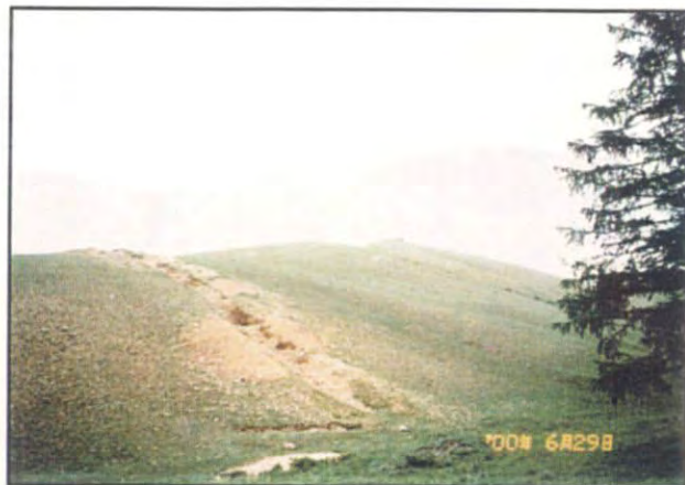
Plate 77 Tosontsengel district, Zost uul (No.98)

Outcrop of altered rock (greisen) with quartz fragment.