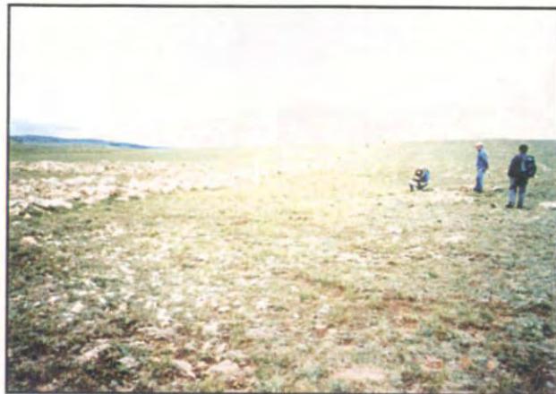
Plate 75 Tsagaan uul district, Khunikh tsakhir (No.97)