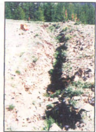
Plate 65 Tsagaan uul district, Tsagaan uul (No.92)