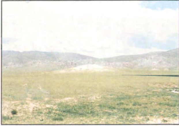
Plate 56 Murun West district, Tsagaan tolgoi (No.89)