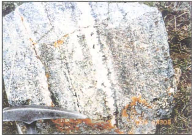
Plate 85 Tosontsengel district, Occurrence124-B-4,5 (No.101)