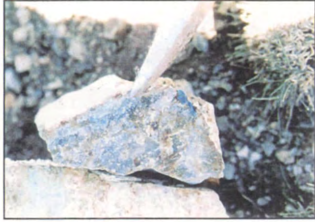
Plate 81 Tosontsengel district, Khuurai sair (No.99)