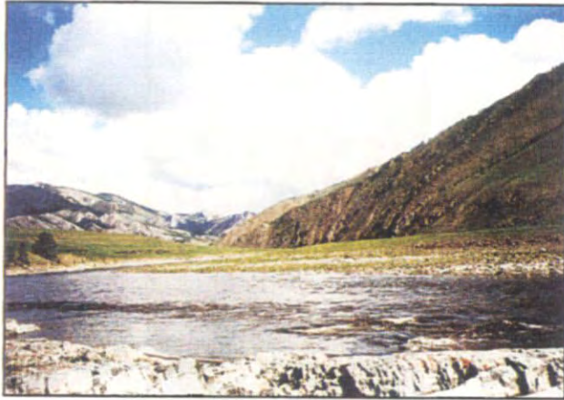
Plate 62 Tsagaan uul district, Khaisiin belchir (No.91)