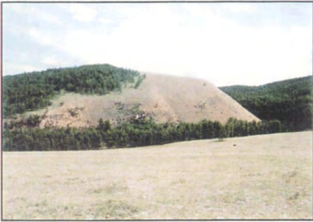
Plate 82 Tosontsengel district, Naranbulag (No.100)