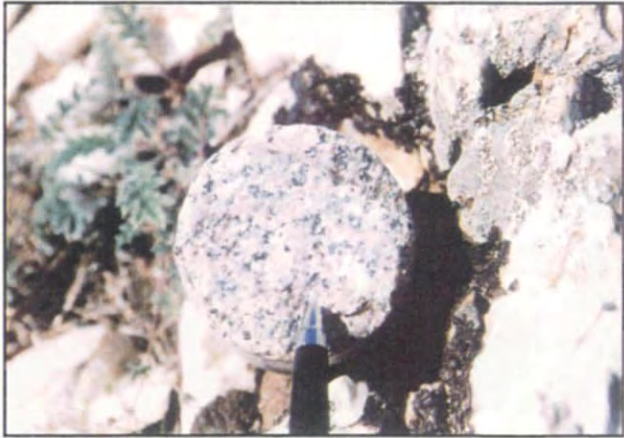
Plate 59 Murun West district, Tsagaan tolgoi (No.89)

Potassic altered granite (drilling core).