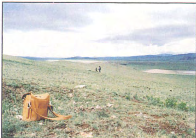
Plate 74 Tsagaan uul district, Khunikh tsakhir (No.97)