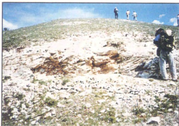
Plate 78 Tosontsengel district, Zost uul (No.98)

Old pit. Limestone is distributed around this pit.