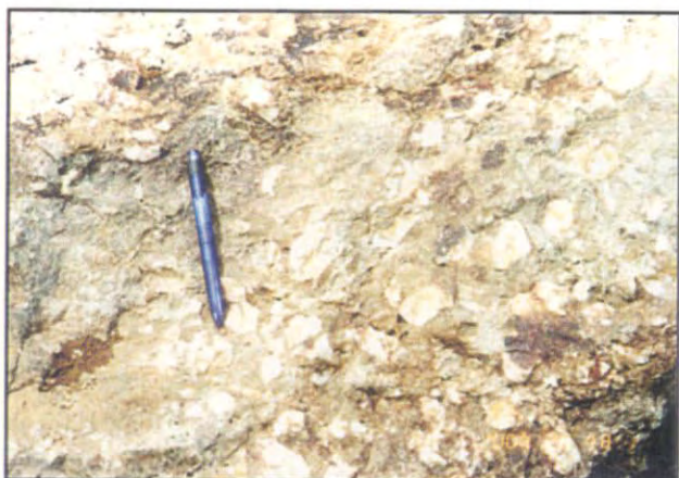
Plate 76 Tsagaan uul district, Khunikh tsakhir (No.97)

Outcrop of altered rock (greisen) with quartz fragment.