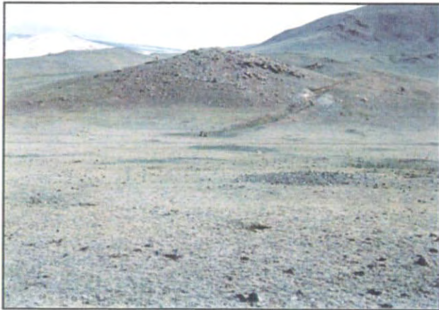
Plate 88 Tosontsengel district, Davaa (No.103)