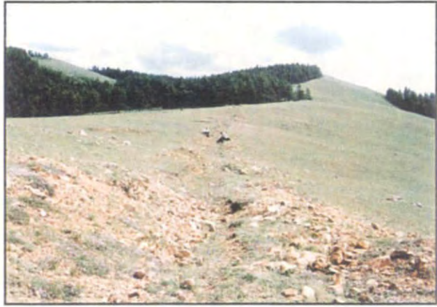
Plate 83 Tosontsengel district, Naranbulag (No.100)