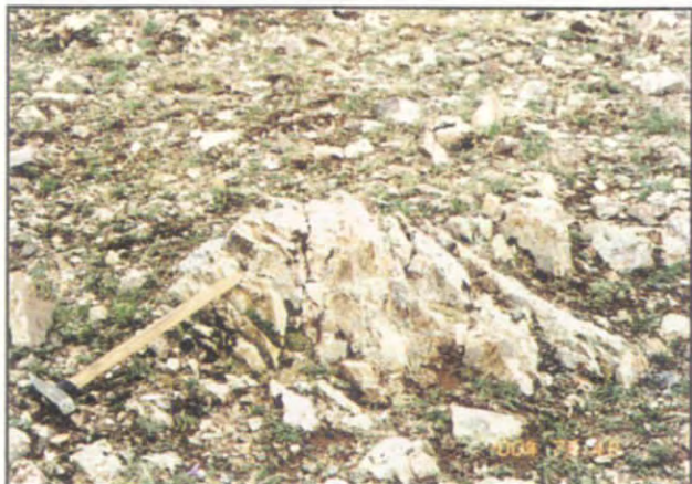
Plate 73 Tsagaan uul district, Gurvan buudal uul (No.96)

Outcrop of meta-sediment with quartz vein.