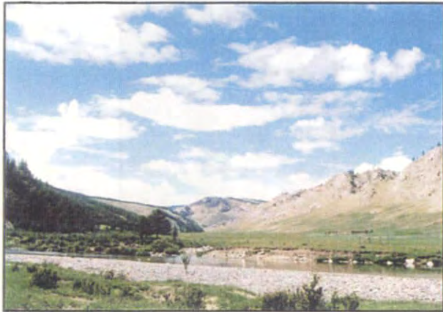
Plate 70 Tsagaan uul district, Deed ulaan tolgoi (No.93)

Panoramic view of the investigated site.