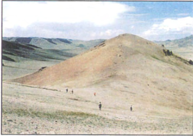
Plate 86 Tosontsengel district, Quartzite (No.102)