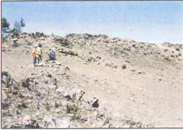
Plate 80 Tosontsengel district, Khuurai sair (No.99)