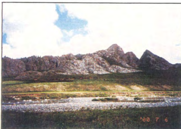
Plate 66 Tsagaan uul district, Nariin azarga (No.93)