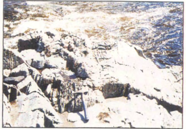
Plate 63 Tsagaan uul district, Khaisiin belchir (No.91)

Outcrop of pelitic shist with quartz vein.