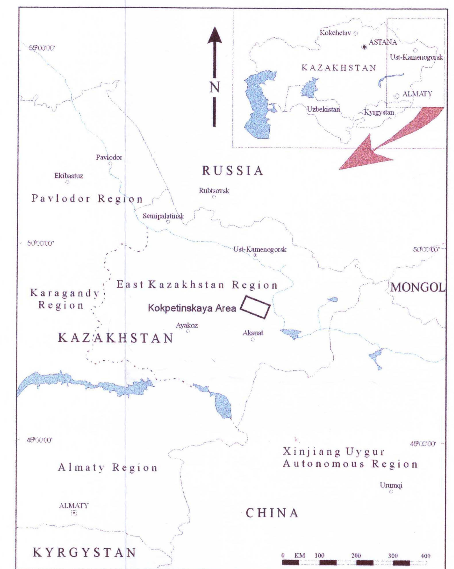
Pl. II-2-2 Schematic Structural Map of the Southern Flank of Bektemir Placer №1 and №3

JAPAN INTERNATIONAL COOPERATION AGENCY METAL MINING AGENCY OF JAPAN JANUARY 2001