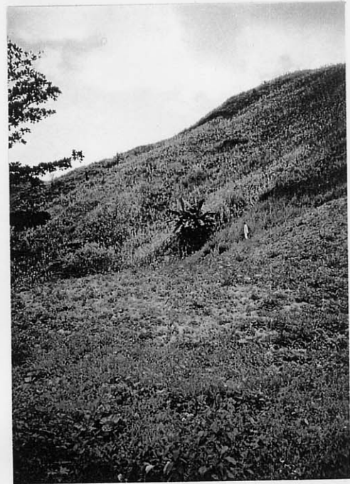
Corn in Hillside (Short Stems)