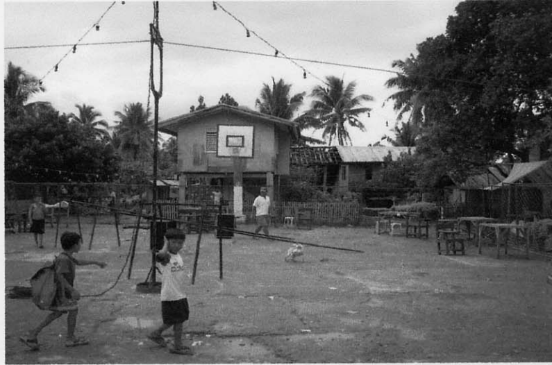
Meeting Hall and Solar Dryer in Marangog