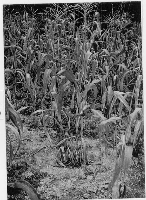
Wet Season Corn Land (Short and Thin Stems with Shallow Soils )