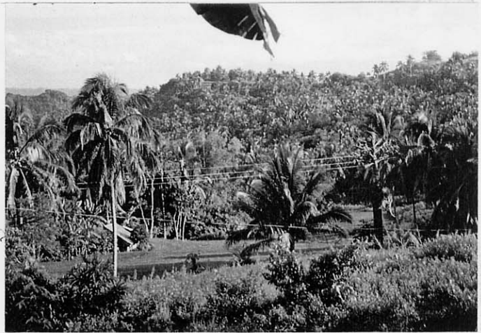
Rainfed Paddy Fields with Coconut