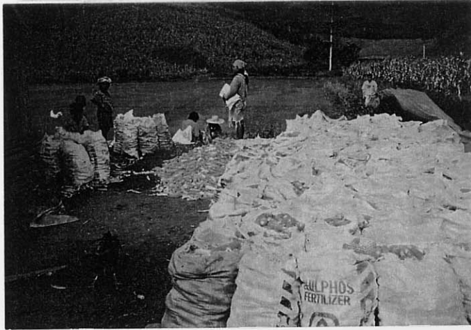
Harvesting of Wet Season Corn