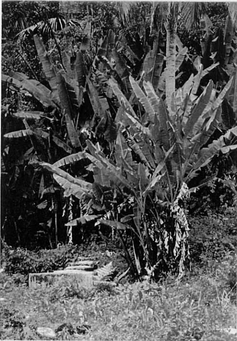
Abaca under Coconut Trees