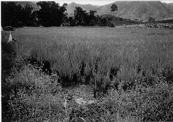
Existing Small Scaled Irrigation by Stream Diversion