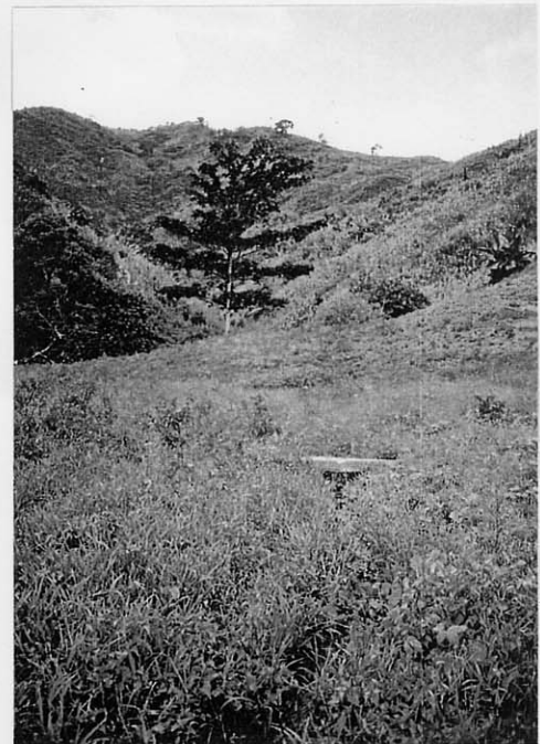
Site of proposed Demonstration Farm, which Philippine side is planning to construct