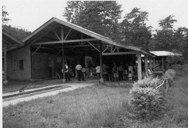
Meeting Hall in Silae-Dalacutan