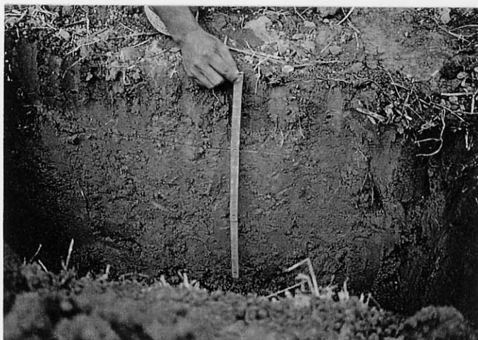
Soil Profile in Hillside Land (Deep Clayey Soils)