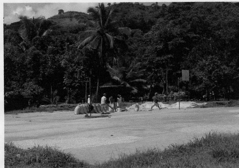
Solar Dryer in Silae-Dalacutan