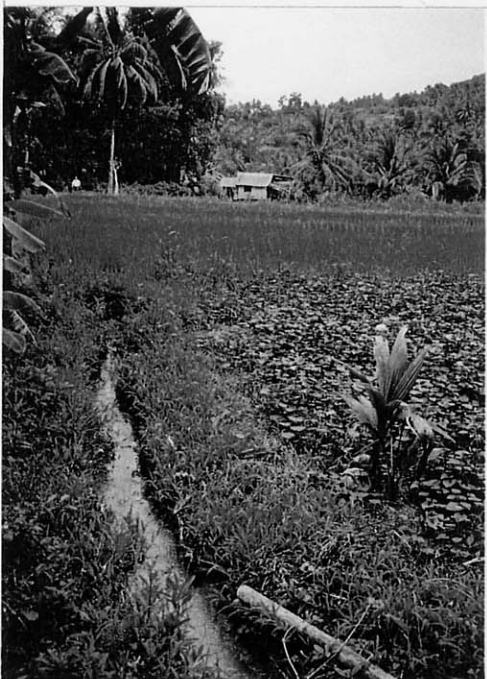
Water from Hillside to Rainfed Paddy Field (Front view shows sweet potato)