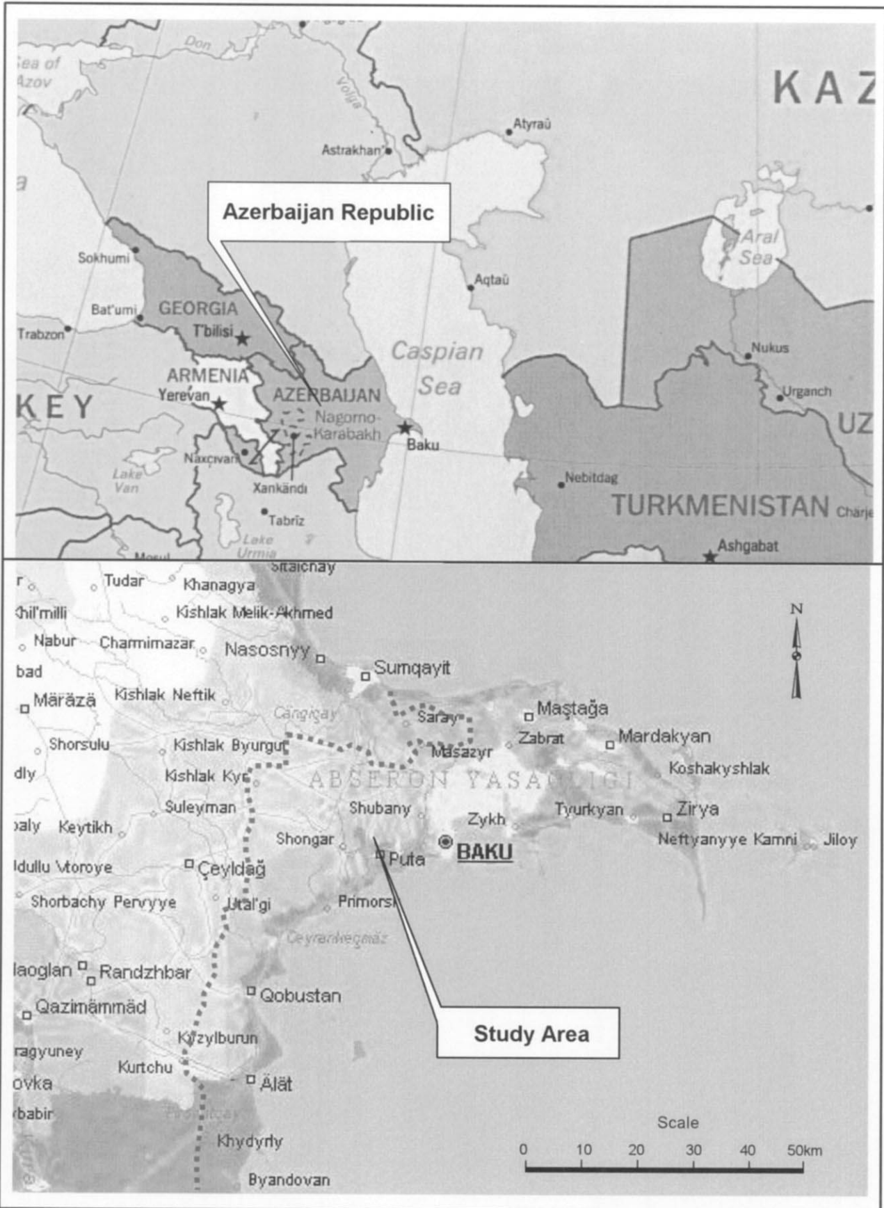
Location of the Study Area