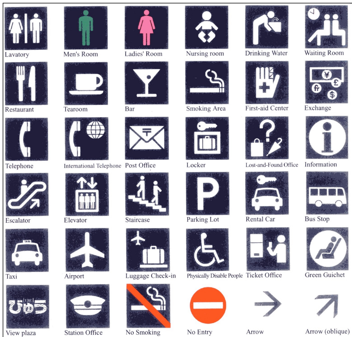
Fig. 7.5.1 Pictographs

Colors of pictograms are basically white-on-gray pictures except prohibitions. But when discrimination by color is particularly required, green is used for men's room and pink for ladies' room. These colors are used as easily recognizable colors even by aged persons or by persons with visual disturbance such as a cataract.