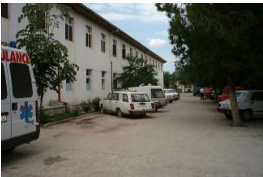
Strumica Health Center