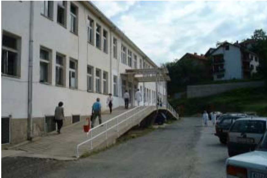
Kriva Palanka Health Center