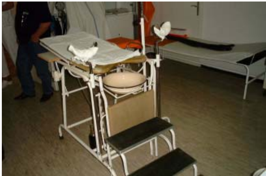
Examination Table without slippers