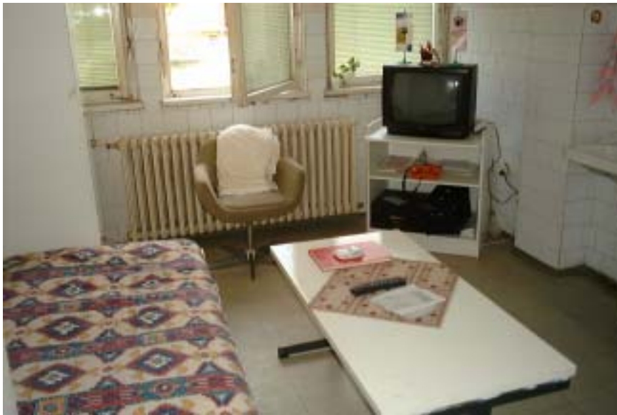
Emergency Department Room for Stand-by