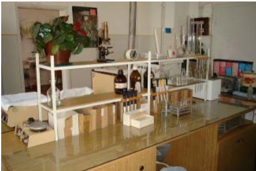
Inside of Laboratory