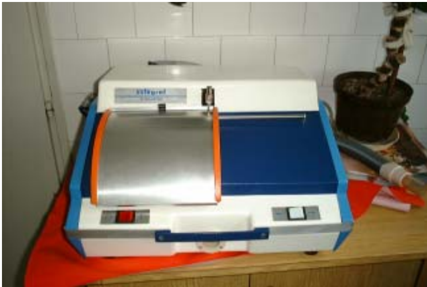
Obsolete Spirometer (beyond repair)