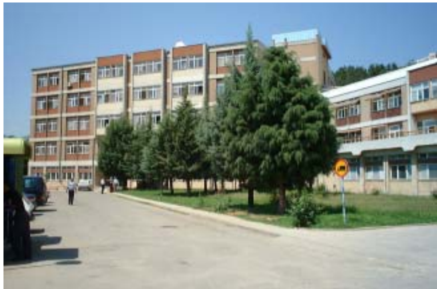
Kocani Health Center