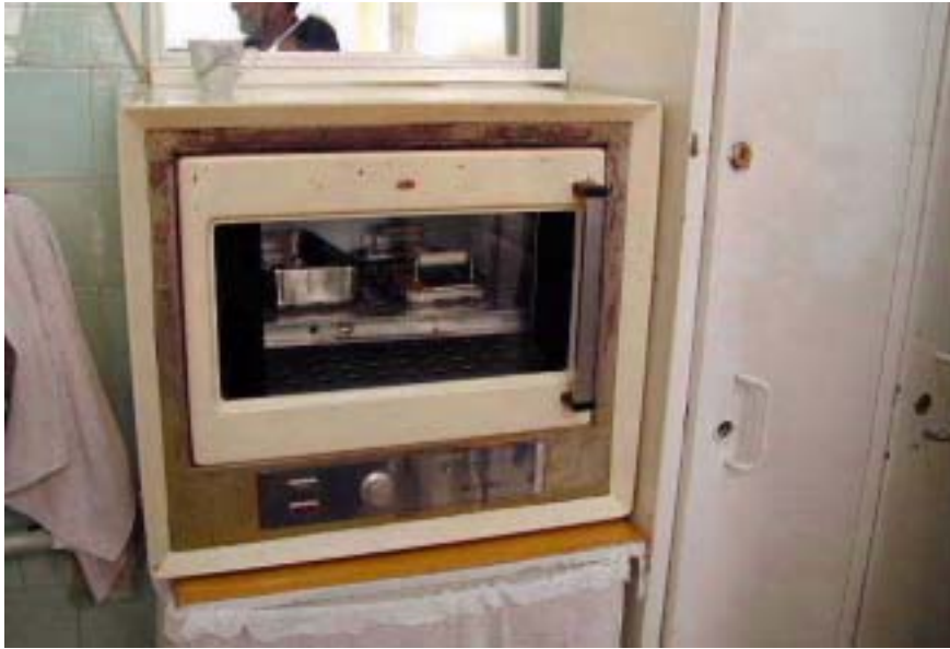
Tabletop Hot-air Sterilizer Rusted Inside