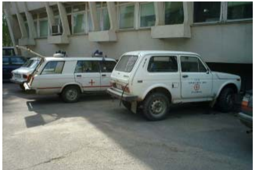
Ambulance Vehicle (backward) Vehicle for Visiting Care (forward)