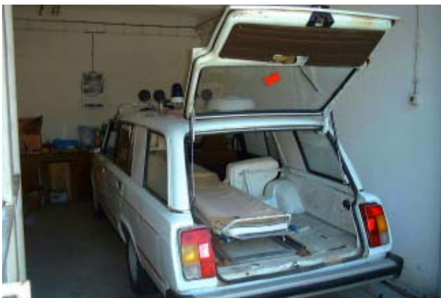
Inside of Ambulance Vehicle