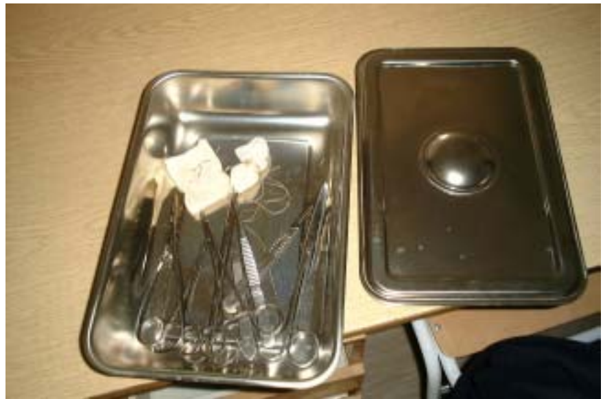
Incomplete Instrument Set for Minor Surgery