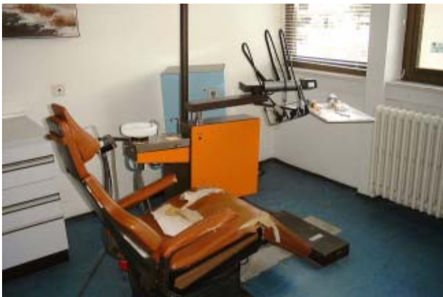
Obsolete Dental Unit