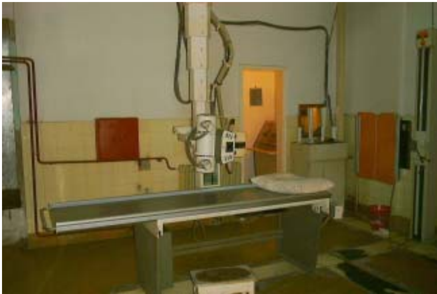
X-ray Apparatus fixed with the Spare Parts from Other Manufacture