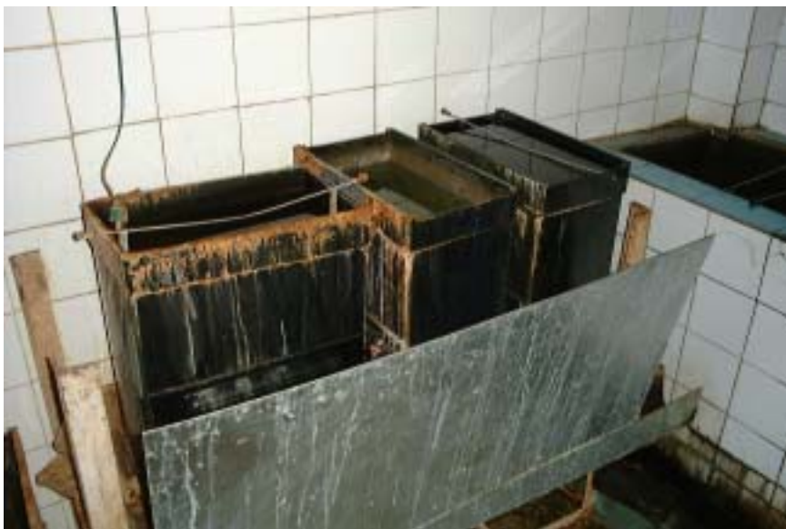
Sink for X-ray film development