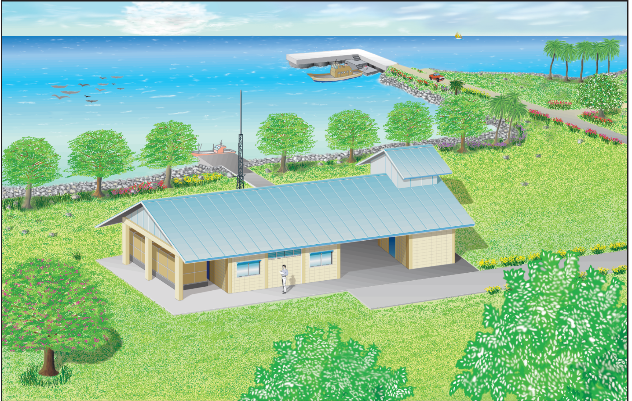
Bird`s Eye View