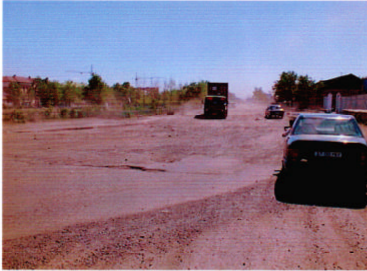
4) West End of Teeverchid Road