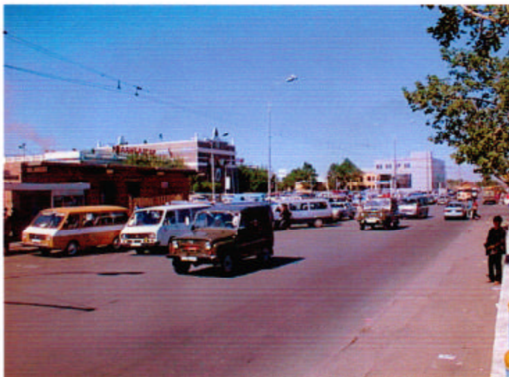
6) In front of the Central Railway Station