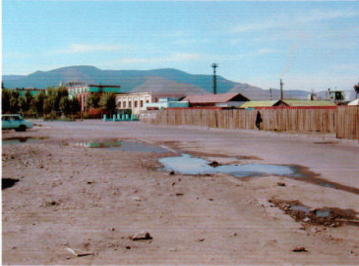
1) Beginning Point on Teeverchid Road