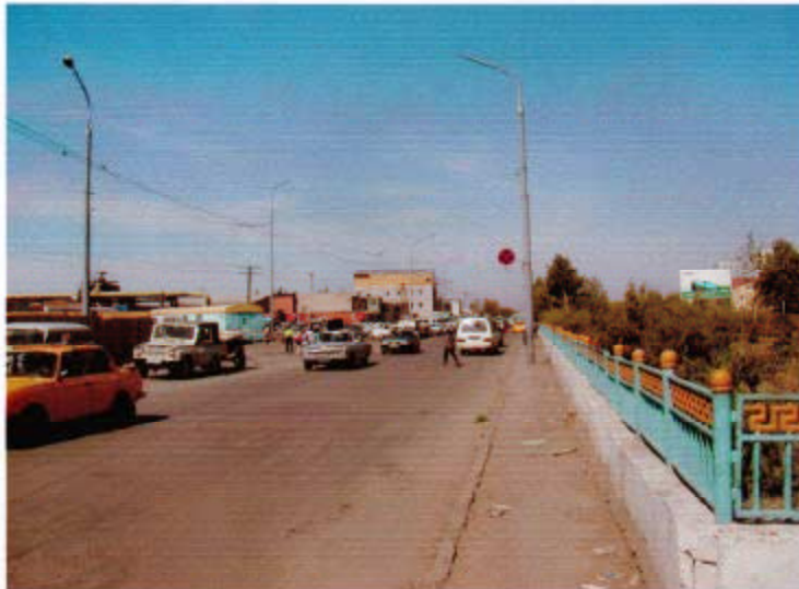
8) East End of Railway Park