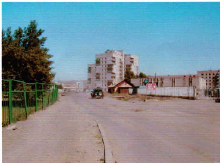
3) West End of Railway Park