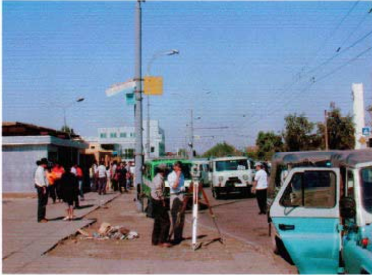
7) East Side of the Central Railway Station