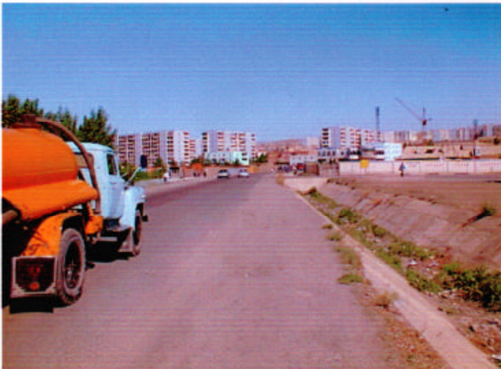
2) Open Ditch along Teeverchid Road at the beginning