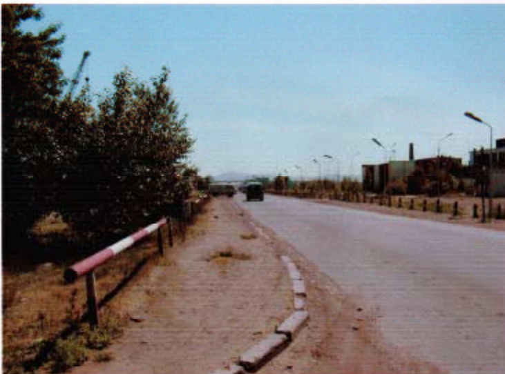
9) South East of Bus Terminal