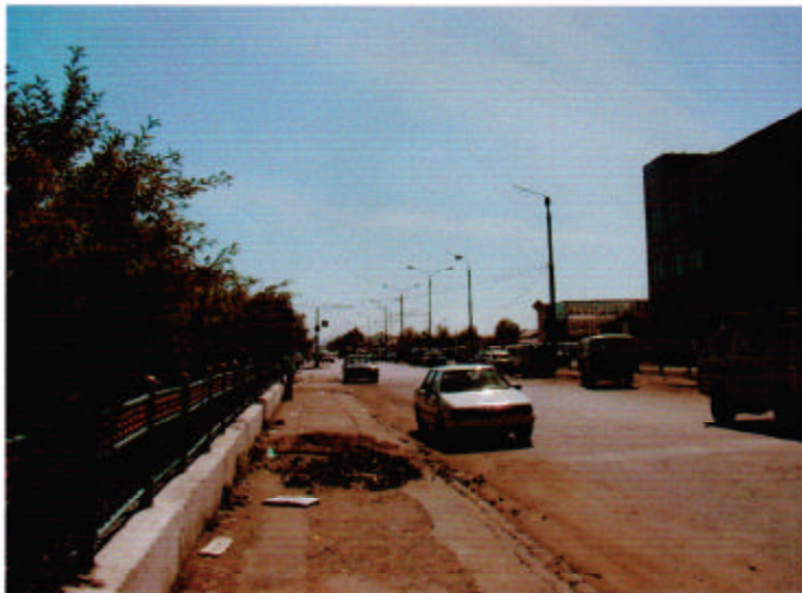
5) West Side of the Central Railway Station