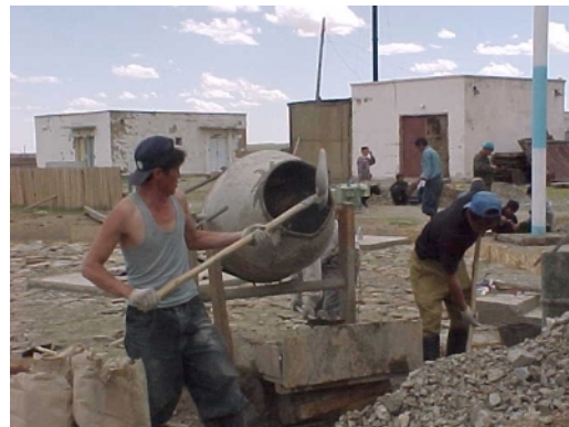
Photo II.1-2 Concrete Works