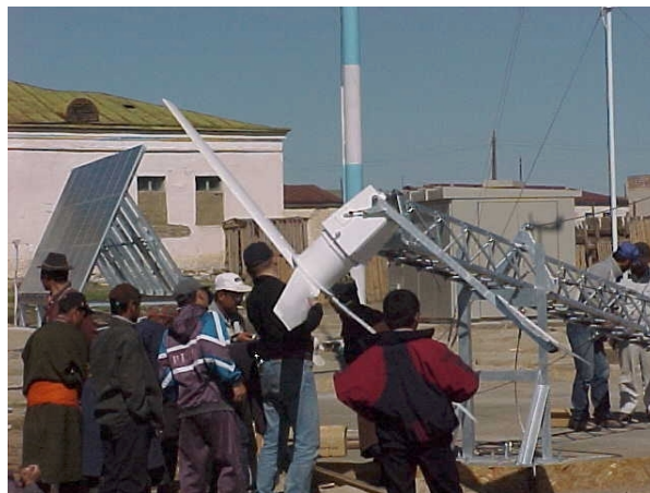
Photo II.1-8 Completing the Assembly of Wind Turbine and PV Array