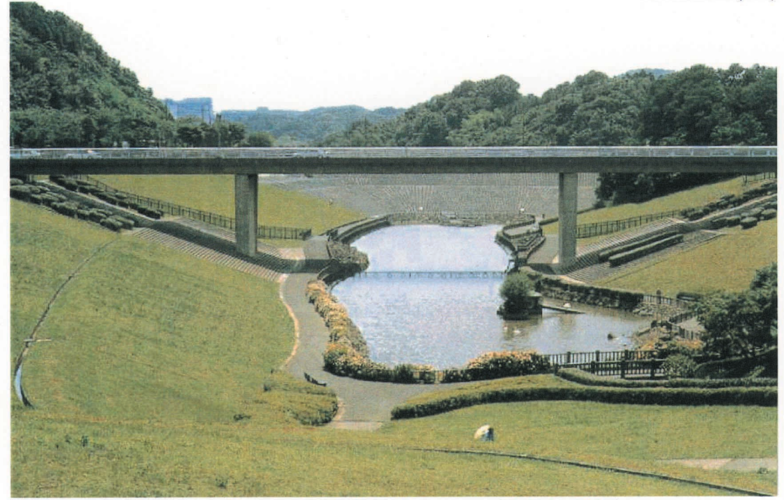
Hosodagawa Detention Pond, Atsugi City, Kanagawa (Built in 1987)