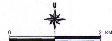
EXISTING LANDUSE BANDAR SUNGAI PETANI 1998 (INTEGRATED URBAN DRAINAGE STUDY)