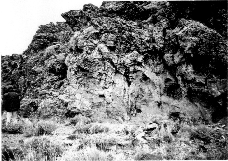
Plate 13. Cerro Gonzalo district : Breccia pipe with malachite mineralization.