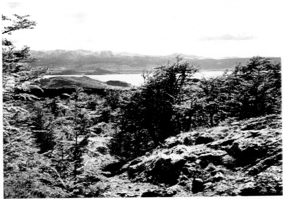
Plate 17. Ferrocarrilera district : View of Lago Fontana from the mineralized site.