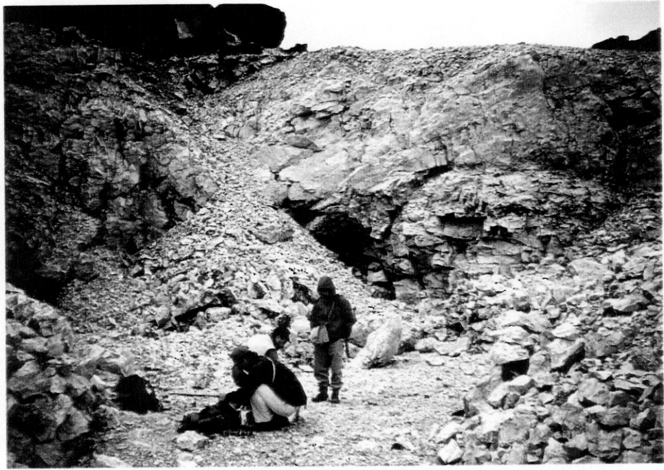
Plate 15. Estrella Gaucha district : Old quarry of kaolin exploitation.