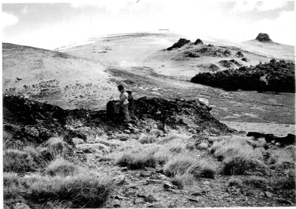
Plate 16. Cerro Blanco district : Sinter-like silicified rock in the alteration zone.