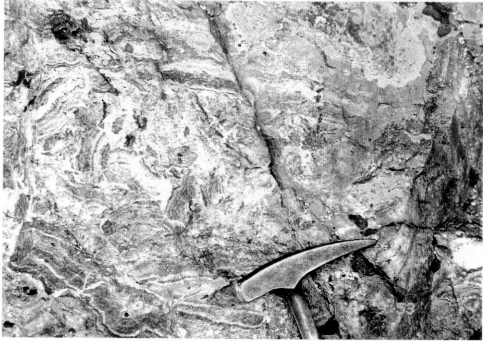
Plate 11. Joya del Sol district : Boiling texture of the Galadriel quartz vein.