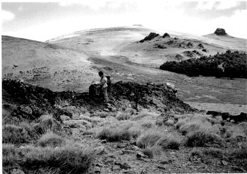
Plate 16. Cerro Blanco district : Sinter-like silicified rock in the alteration zone.