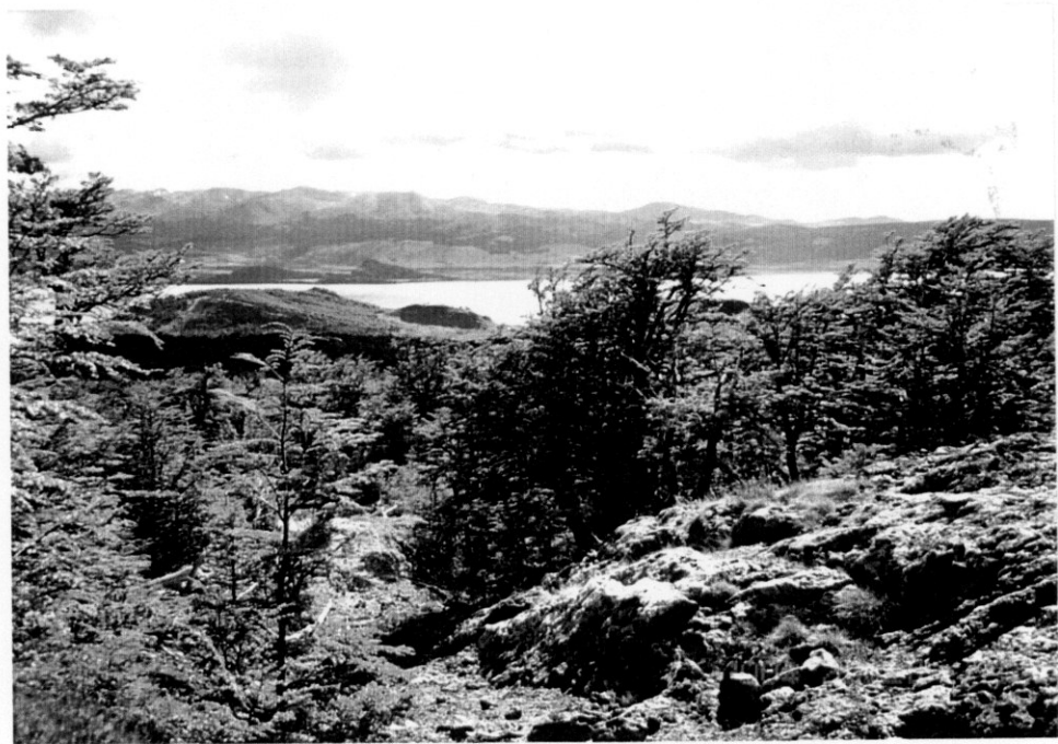
Plate 17. Ferrocarrilera district : View of Lago Fontana from the mineralized site.