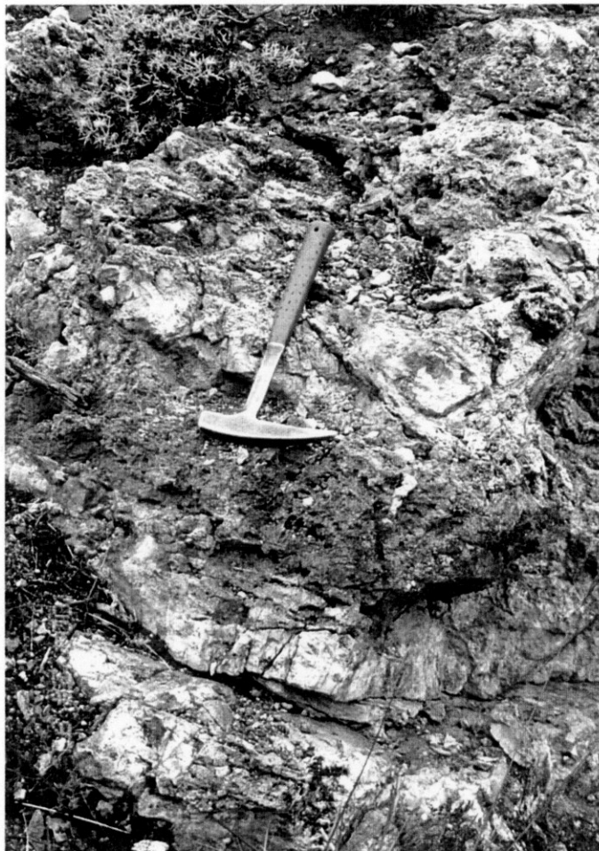
Plate 14. Arroyo Cascada district : Not so inclined quartz veins. A sample revealed 4.07g/t Au content.