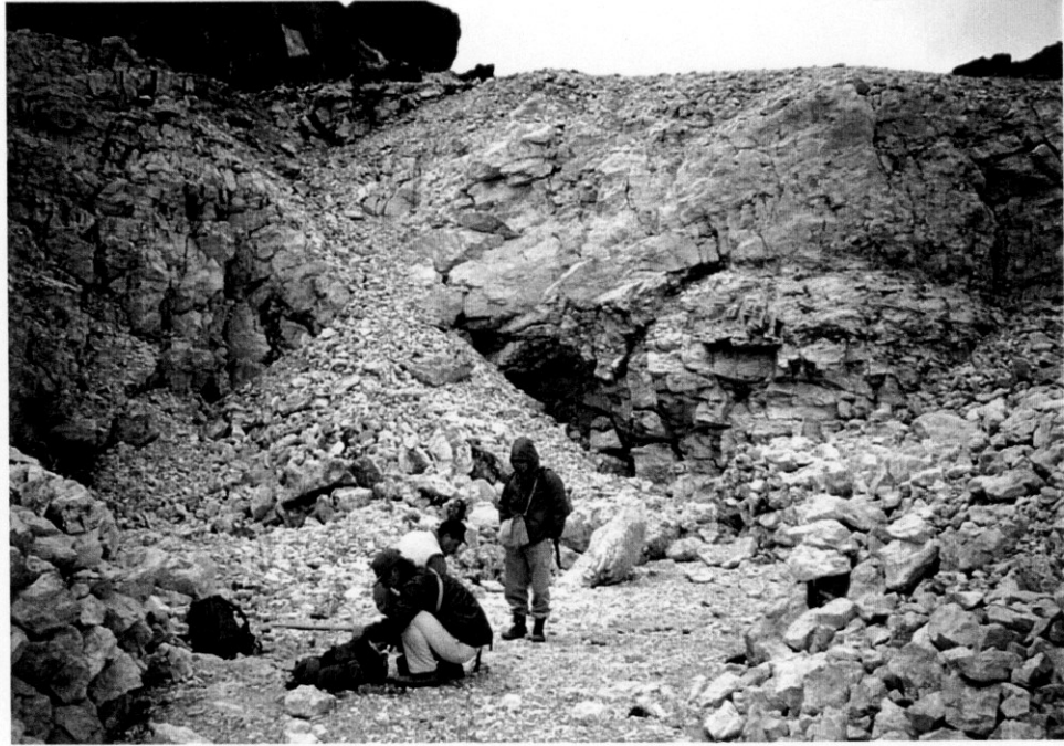
Plate 15. Estrella Gaucha district : Old quarry of kaolin exploitation.