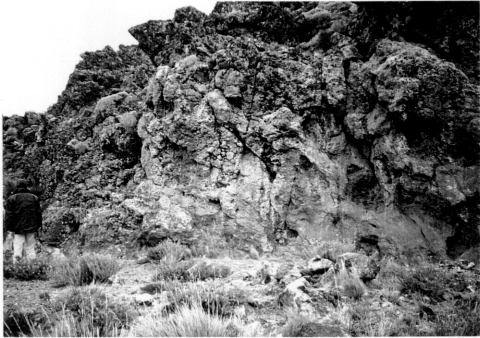
Plate 13. Cerro Gonzalo district : Breccia pipe with malachite mineralization.