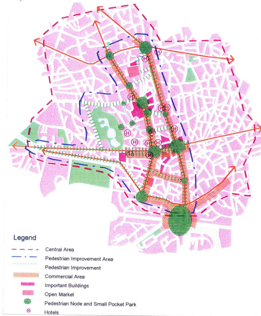
Figure 15.3 Improvement of Pedestrian Environment