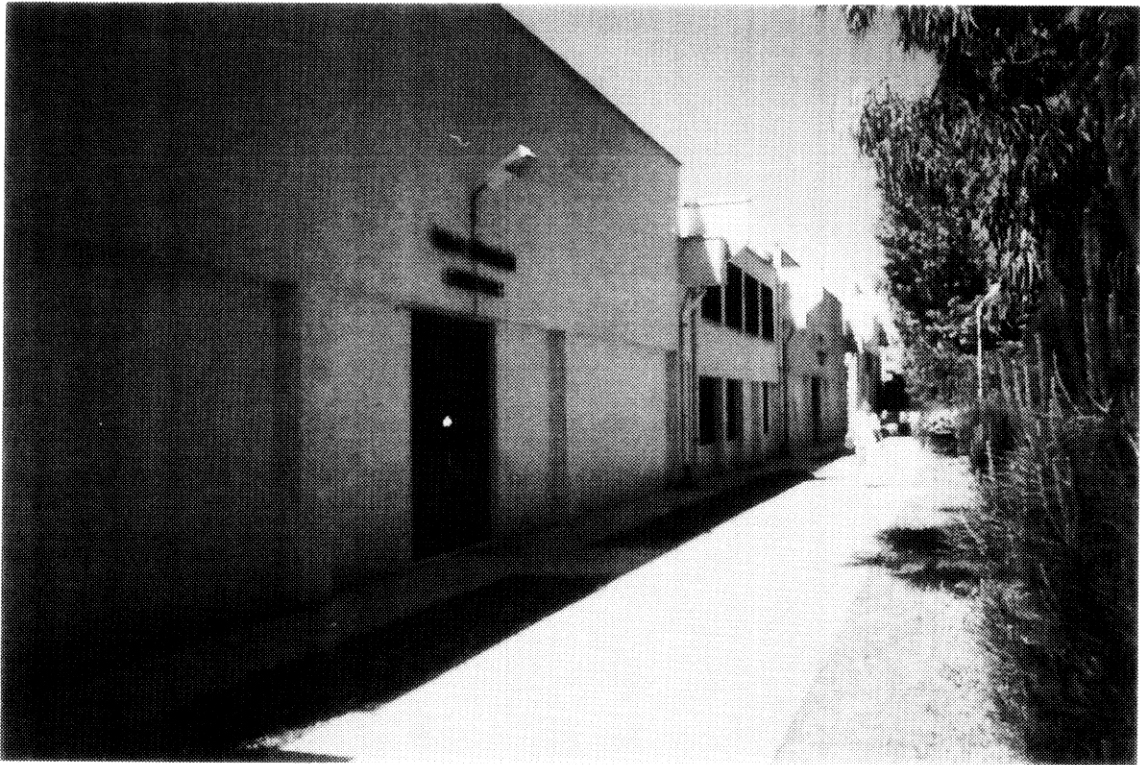
Cukurova University - Soil Mechanics Laboratories