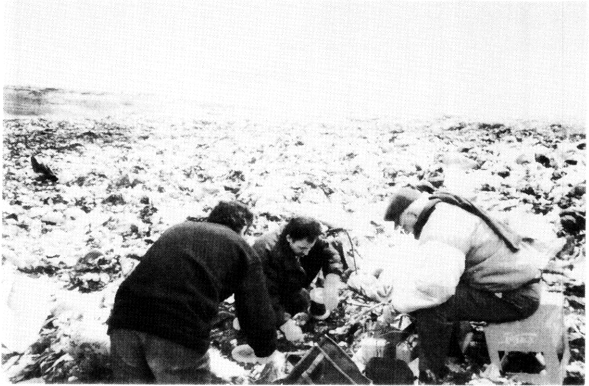
Execution at the JF7