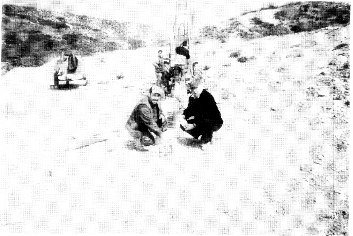
Drilling the Borehole 2