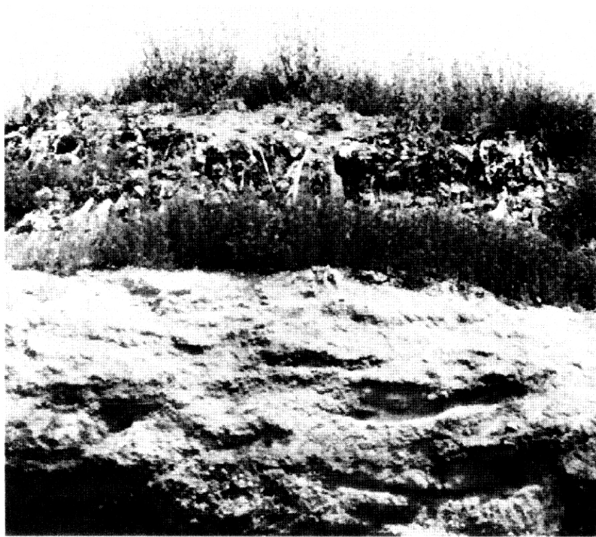
Figure 13-36: Waste disposal site is dominated by a ruderal community consisting of Silybum marianum (braunish) and Urtica pilulifera (green)