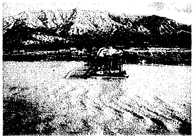
Type B1: Tilting of Substructure