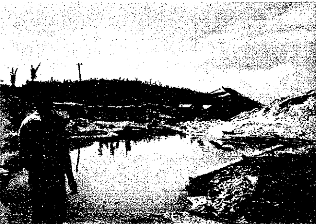
Type A2: Accumulation of Ash Fall inside Drainage Pipe (Urban Road)