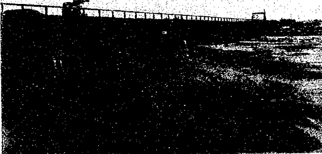
Type W2: Sediment of Riverbed