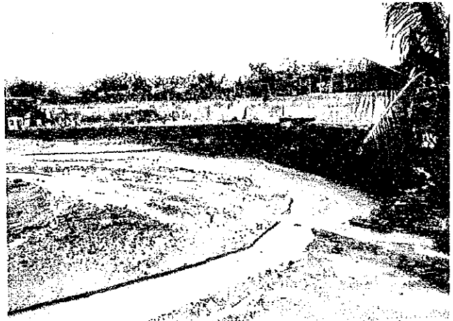
Type W1: Scouring of Riverbed