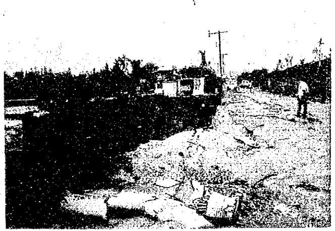
Type R3: Scouring of Embankment