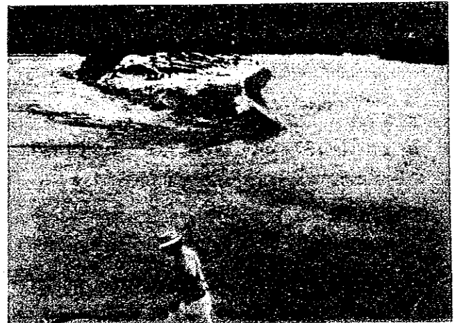
Type W3: cut of River Bank