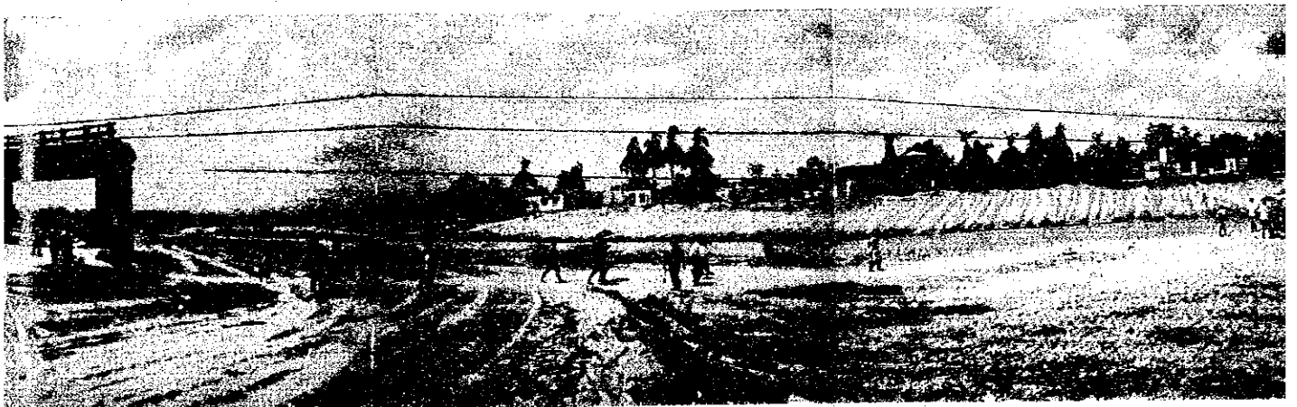
Type B2: Collapse of Bridge