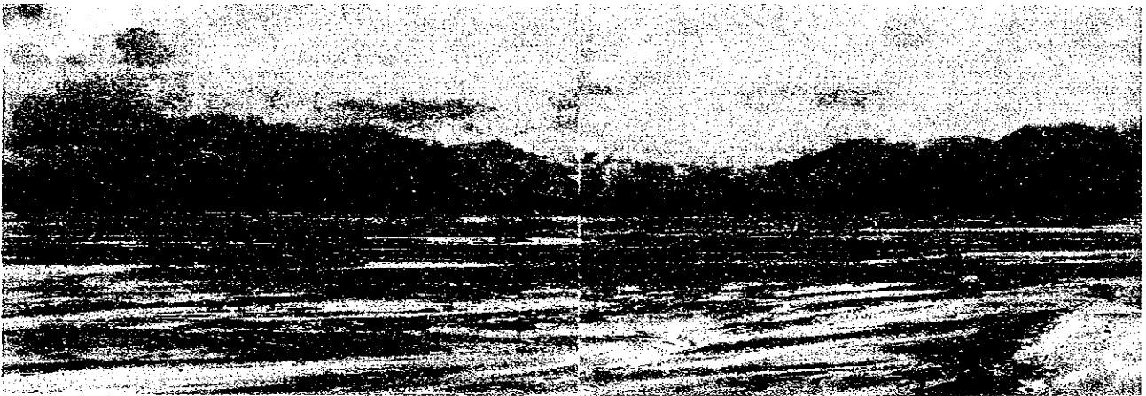
Type W2: Sediment of Riverbed