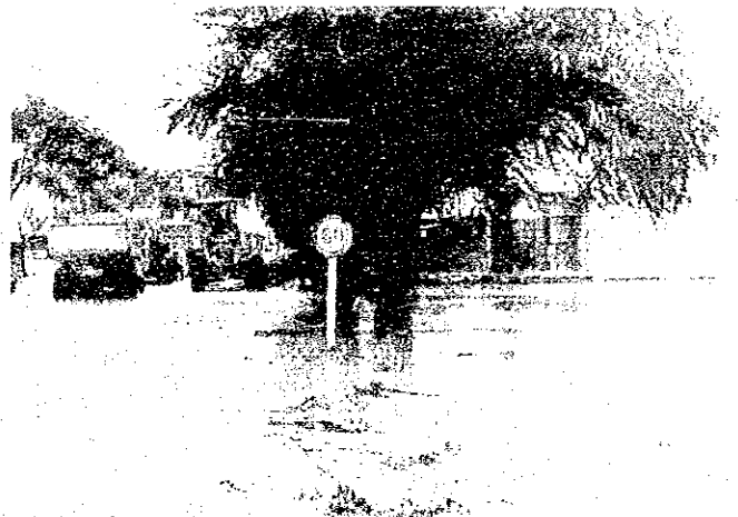
Type R1: Mud Flow on Road