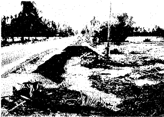
Type R3: Scouring of Embankment