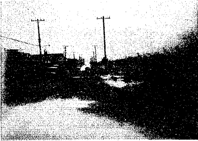
Type A1: Accumulation of Ash Fall on Road Surface (Urban Roads)