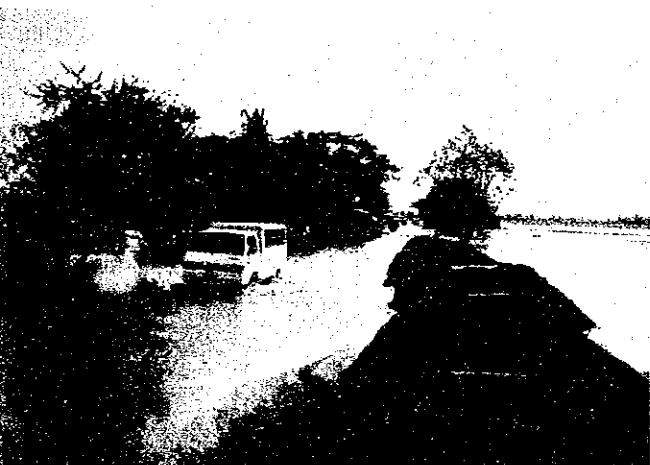
Type R1: Mud Flow on Road