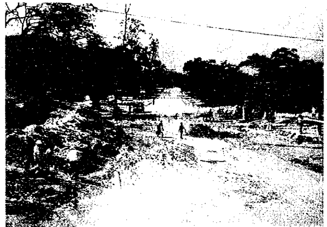
Type A2: Accumulation of Ash Fall inside Drainage system (Rural Road)