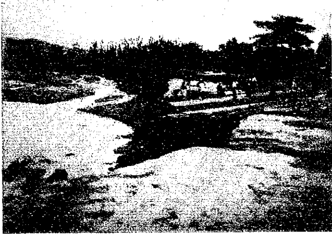
Type R2: Road Cut due to shifting flow