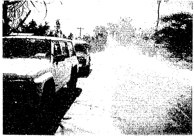
Type A1: Accumulation of Ash Fall on Road Surface (Rural Roads)