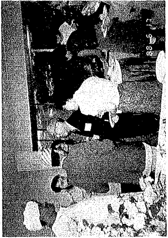
1-4 At the Party