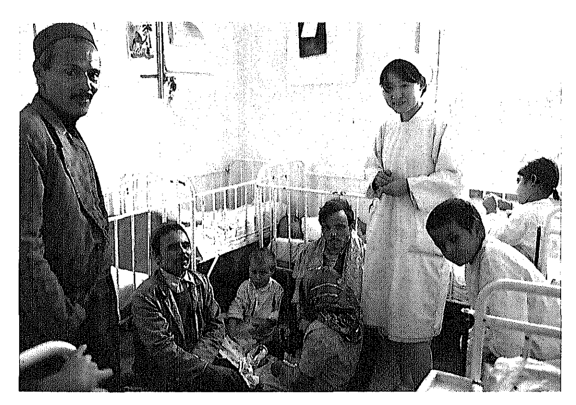
A Japanese nurse serving in Tunisia under JOCV Programme