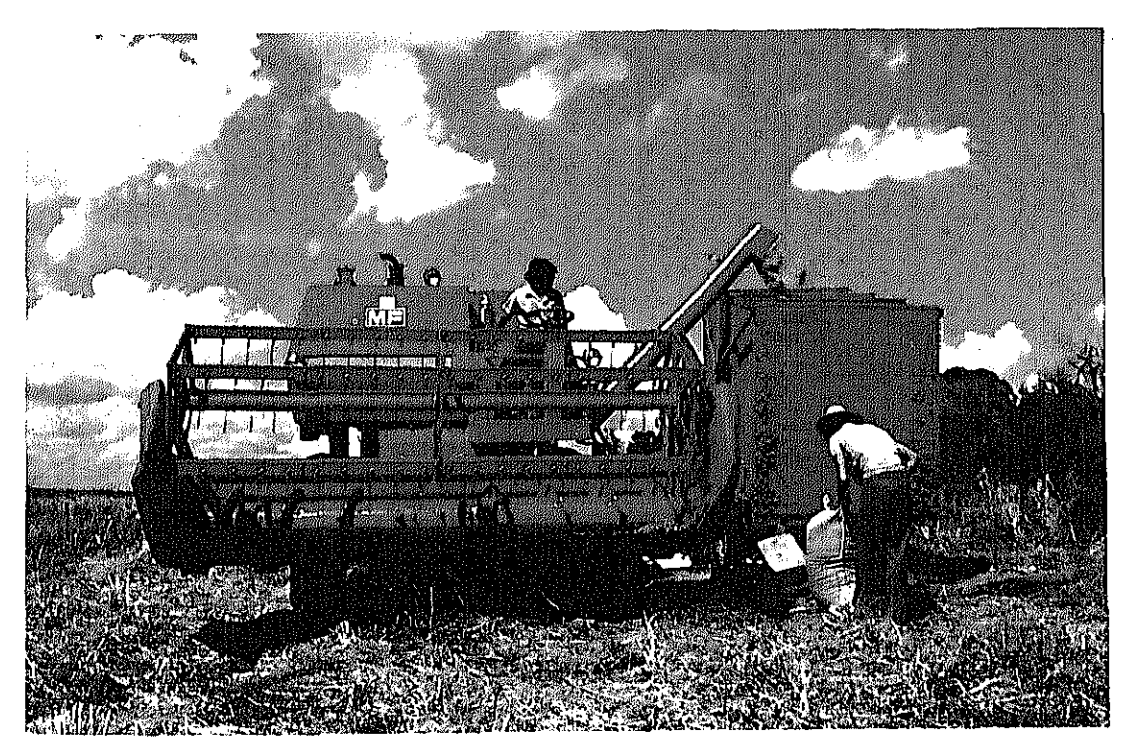
Harvesting in a Japanese settlement in Brazil

As one of the activities related to the above-mentioned services, pasture land management was undertaken to provide emigrants with assistance and guidance and to promote emigration.