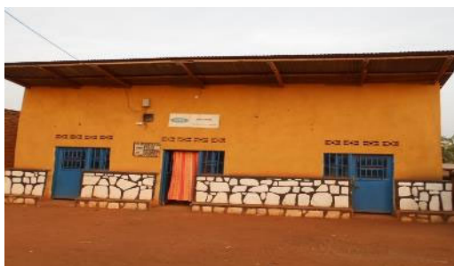
Photo 1 Constructed House for Business Expansion by Cooperative

the cooperative. As mentioned above, after the SMAP training, as the result of the improvement of the yield and profit, the cooperative has got several positive impacts.