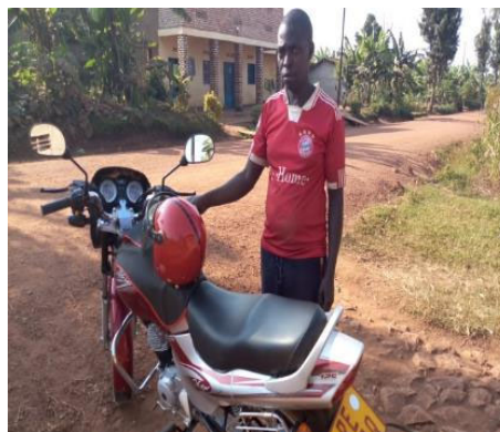
Photo 4 Procured Motorcycle by Cooperative Member