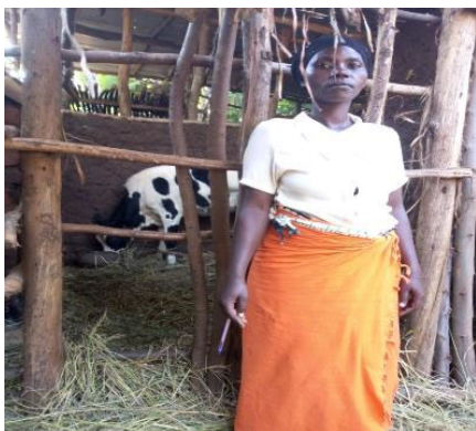
Photo 3 Procured Livestock by Cooperative Member

As mentioned above, the improvement of the yield and cooperative profit through the SMAP training has given several positive impacts at a not only cooperative level but also household level.