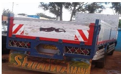
Photo 2 Procured Truck for Paddy Transportation by Cooperative