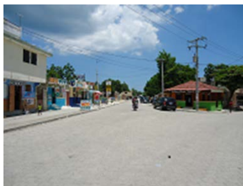
A Road improved by this project