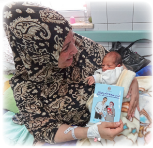
Palestinian mother and her infant with their MCH Handbook

and having the MCH Handbook are more likely to spend a longer time at health center. This may imply that the MCH Handbook serve as the useful catalytic tool that promotes adequate consultation, care and communication between healthcare providers and women. Those who both get pregnant for the first time and have the MCH Handbook are likely to have more frequent discussions with husbands and healthcare providers than those who don't. Thus, the MCH Handbook might have functioned as the powerful interface that helps fill the communication gaps between women, husbands and healthcare providers.