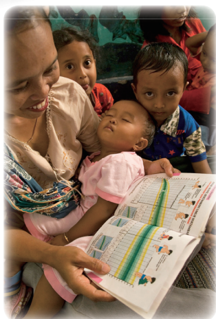
Mother with the MCH Handbook at the integrated health post in East Java

but not seen [as it was kept by a health volunteer or midwife at the integrated health post]' were considered the MCH Handbook users. Those who answered either 'Yes, but not seen [as it was already lost]' or 'No, never had' were considered not being the MCH Handbook users. Overall national prevalence of the MCH Handbook increased from 38.4% in 2007 to 55.2% in 2010 (Figure 1). Provincial prevalence ranged from 23.1% (West Irian Jaya) as the lowest to 81.6% (Yogyakarta) as the highest.